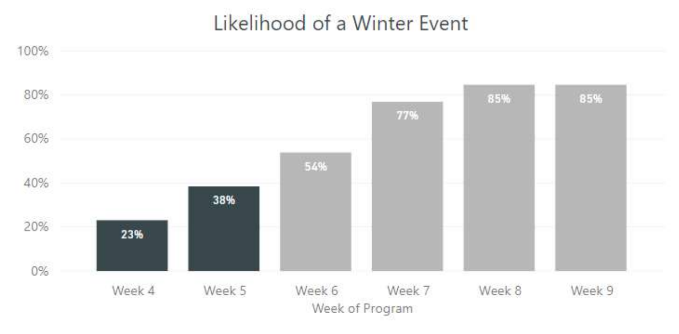
Figure 2. The darker bars represent the weeks of the proposed 4-week cycle at risk to a winter event.

winter event interrupting or terminating the leaf collection program is significantly reduced. Ending in week five also allows DPW to fully prepare its equipment for winter and sets clear, consistent expectations for residents that after the second cycle ends in mid-November, as proposed, the curbside program is over and the free bagged program should be used to dispose of their remaining leaves.