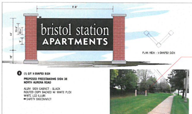
Proposed Sign Type #3B - Double Faced Monument Sign