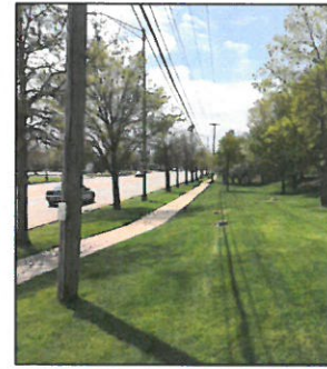
Existing View Looking West Along North Aurora Road