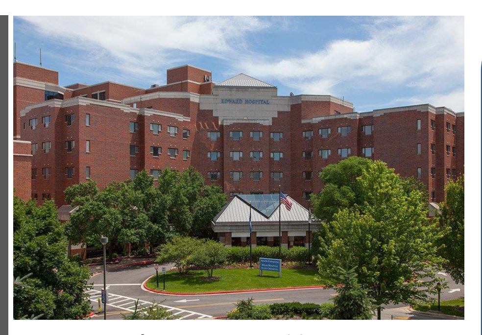
Our Saviour's Campus Neighbor, Edward Hospital

We have taken our neighbors into consideration