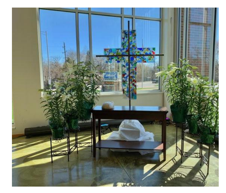
Our Saviour's Celebration Campus 919 S Washington Street, Naperville, IL