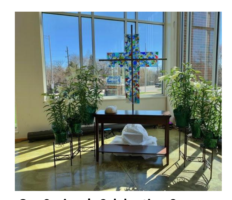
Our Saviour's Celebration Campus 919 S Washington Street, Naperville, IL

Current Amplifier Permit Restrictions and Permission Requests