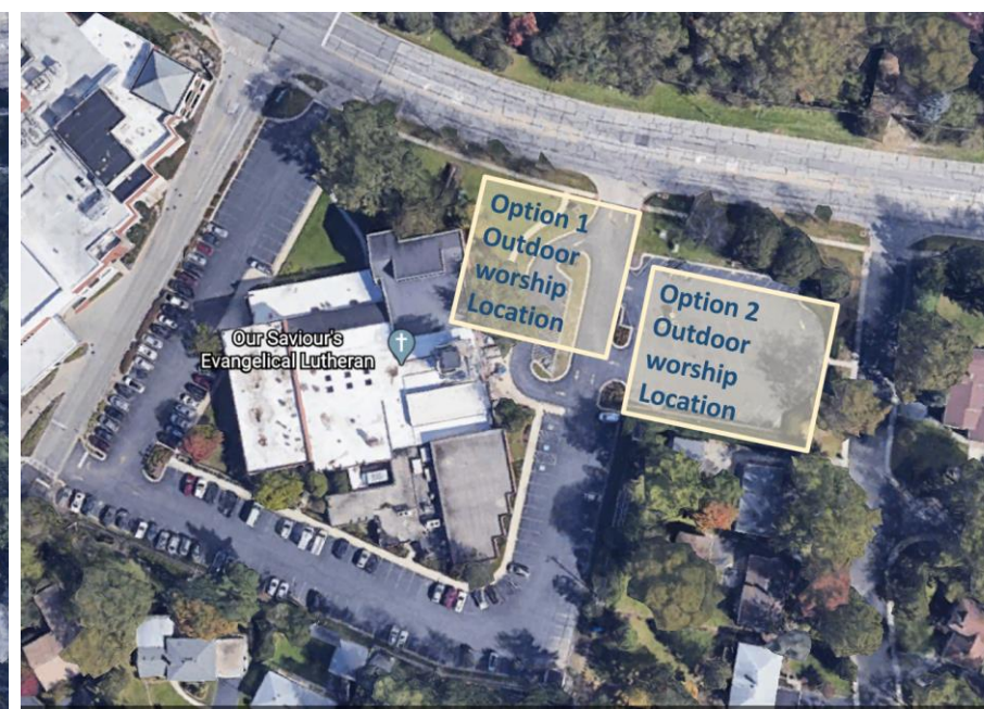
Our Saviour's Campus 815 S Washington Street, Naperville, IL

Participant numbers limited to meet CDC, Local, and State Guidelines.