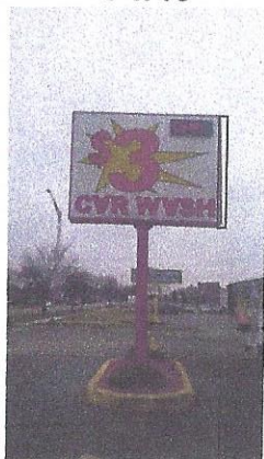
EXISTING SIGN 8' X 10'