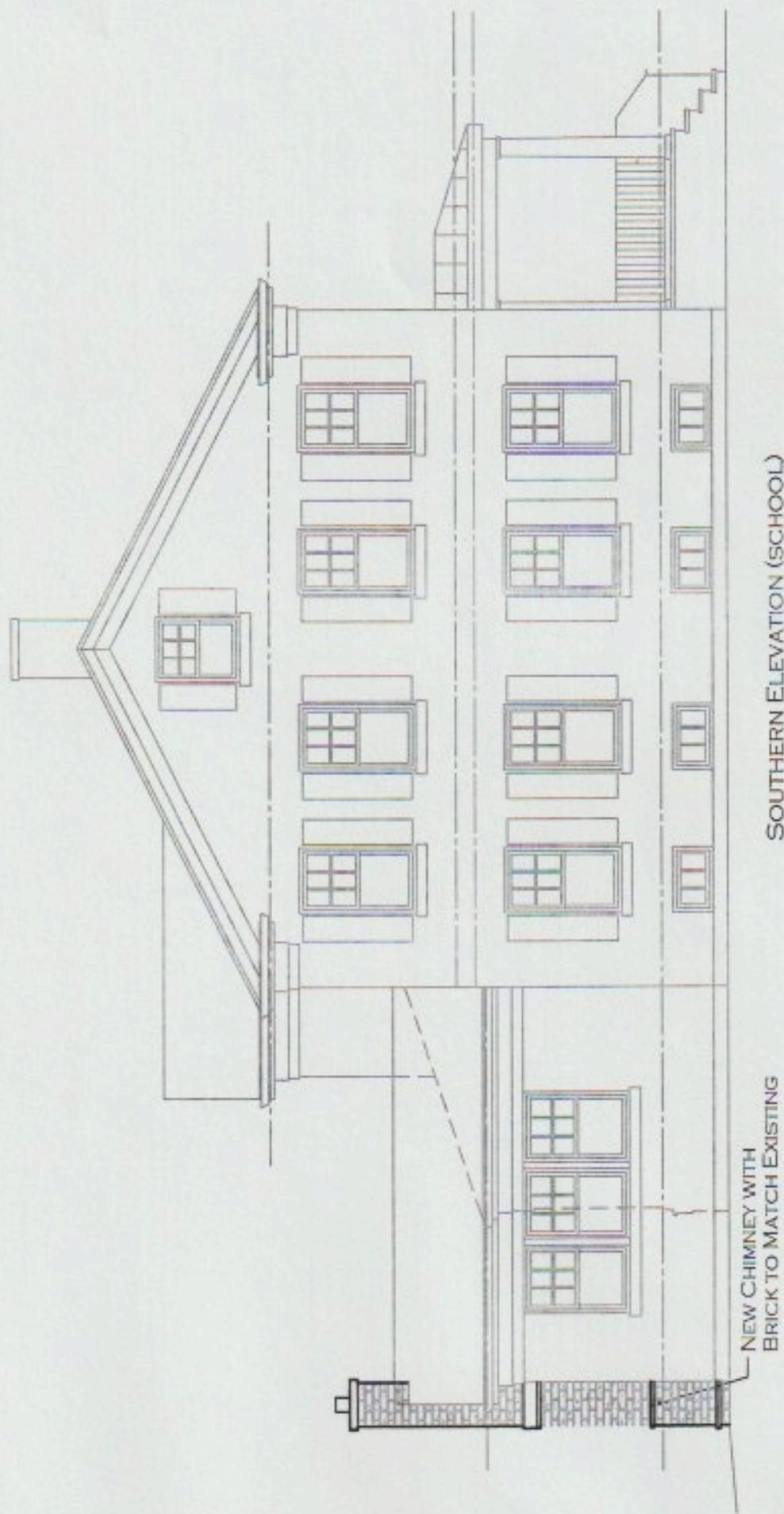
SOUTHERN ELEVATION (SCHOOL)