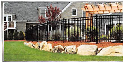
Ameristar Montage Steel Fence