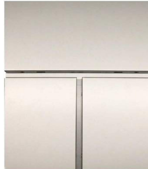
COMPOSITE METAL PANEL-1