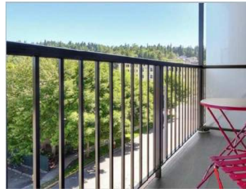
METAL BALCONY RAILING