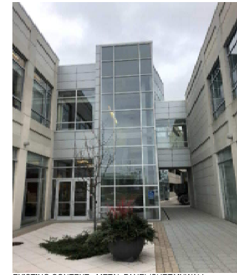
EXISTING CONTEXT - METAL PANEL/CURTAINWALL