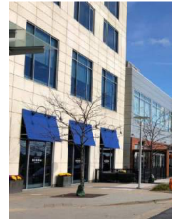
EXISTING CONTEXT - PRECAST CONCRETE