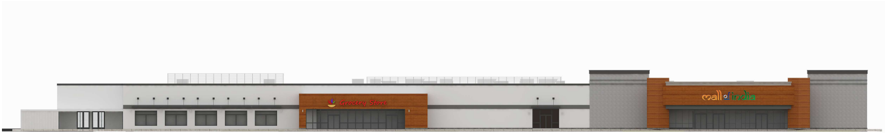
Proposed Front Elevation/ West Side