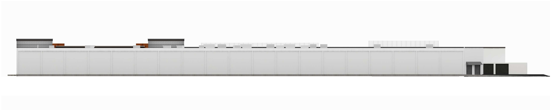
Proposed Rear Elevation/ East Side