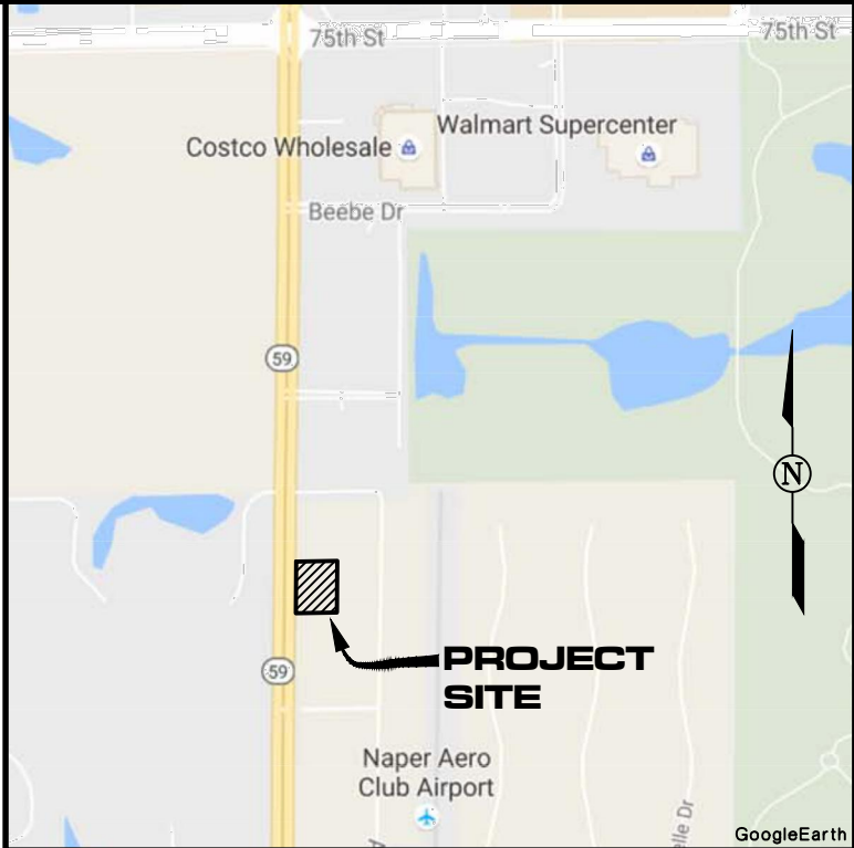
LOCATION MAP N.T.S.

PIN: 07-34-100-013 07-34-100-014 07-34-100-015 07-34-100-016 07-34-100-033 07-34-100-034 07-34-100-035 07-34-100-036