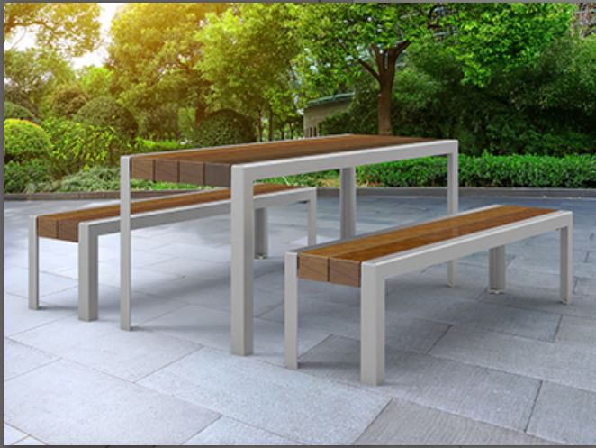
Standard height table and benches