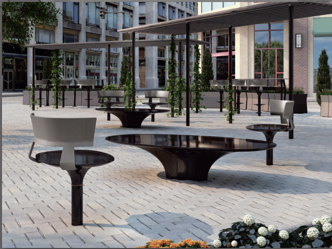
Lounge chair and coffee table