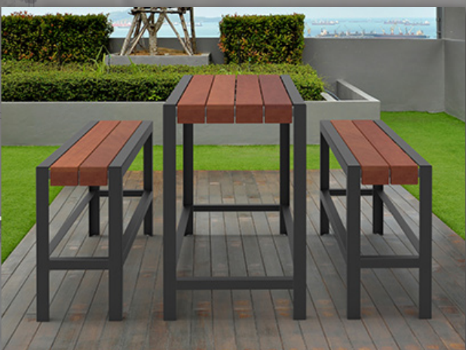
Long Bar height table with benches