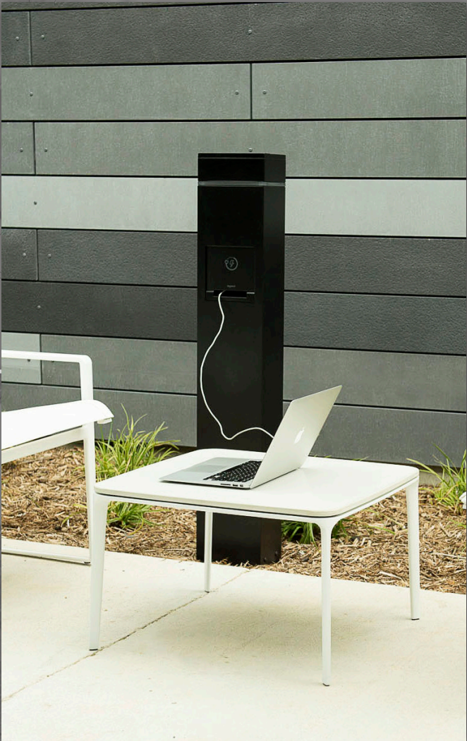
Power pedestal (4 total)