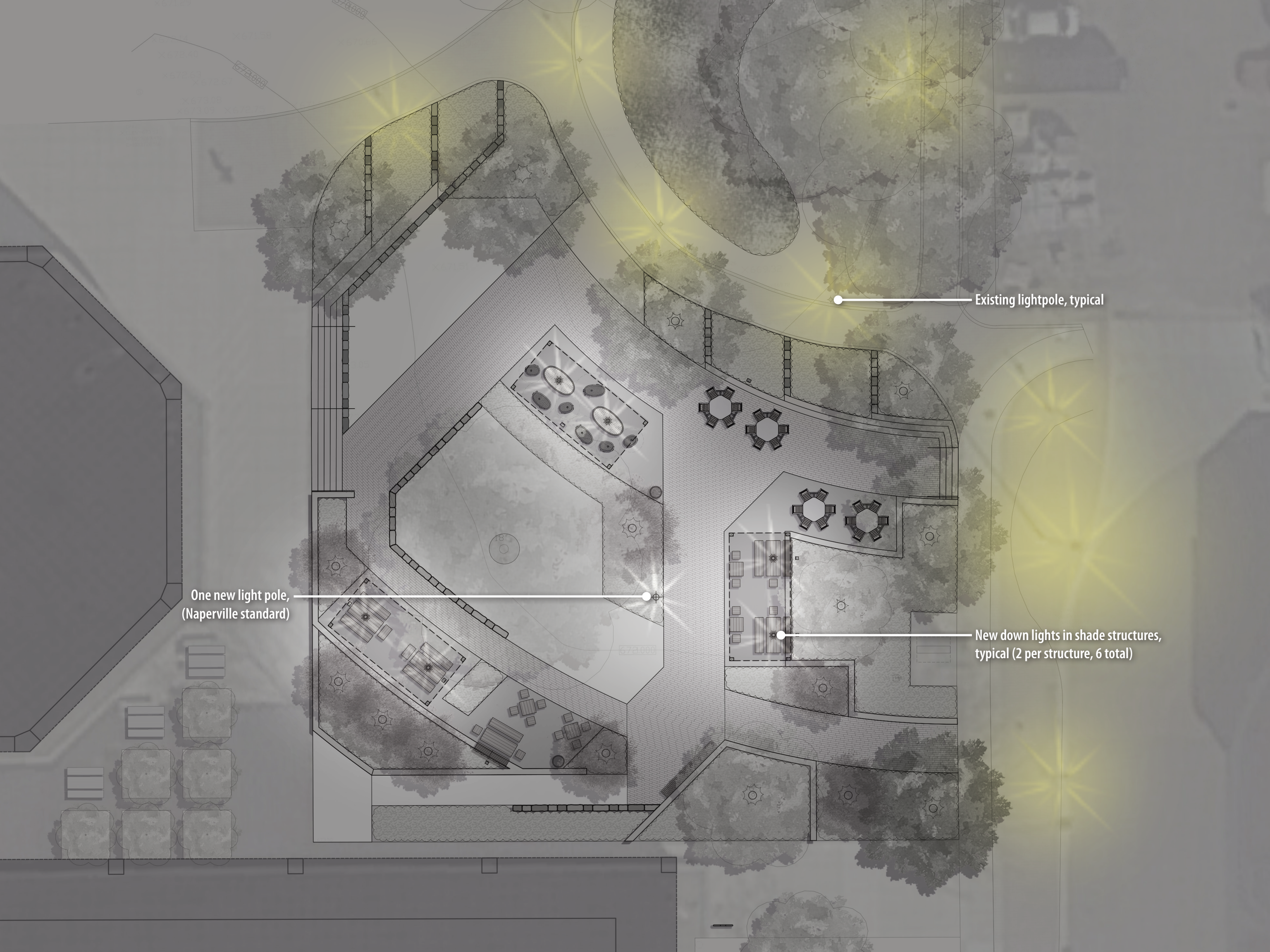
Existing lightpole, typical