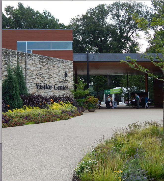
Shrubs and perennials