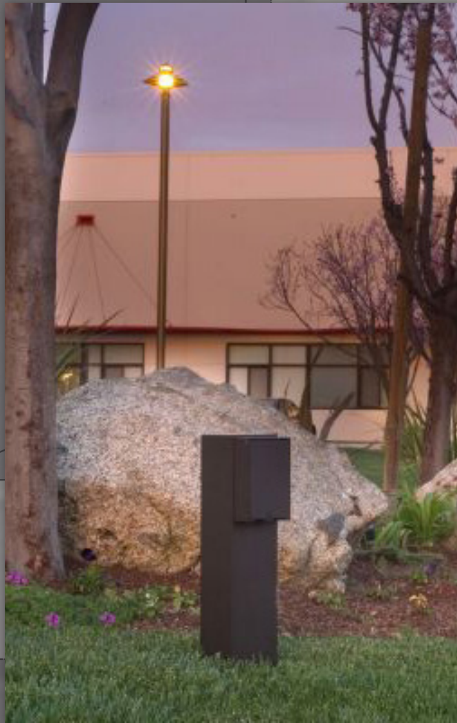
Power outlets (4 total)