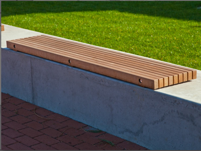
Wall mounted benchtop