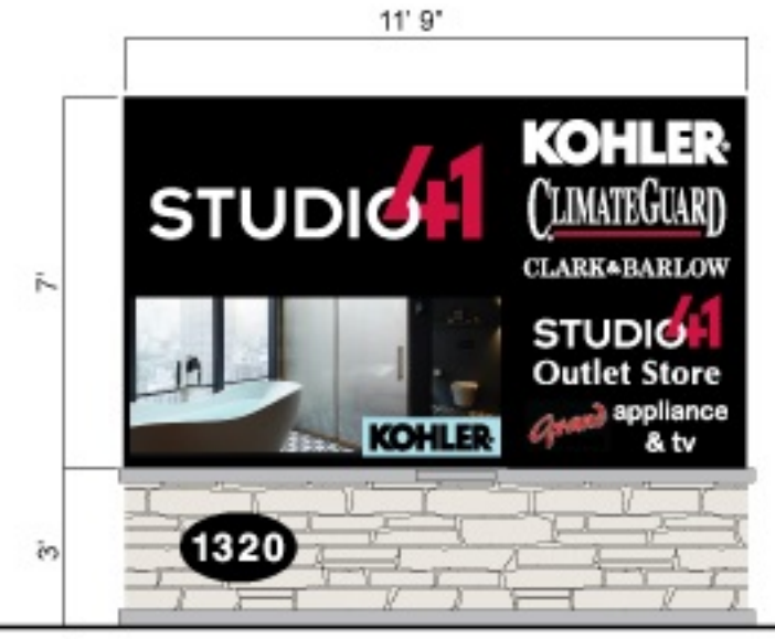
7' x 11' 9" = 82 sq ft 3' x 7' EMC screen