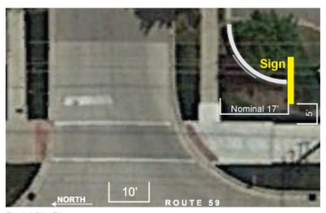
Partial Site Plan

09.27.2017 Design Pointe Studio 41 1320 N. State Route 59 Naperville, IL