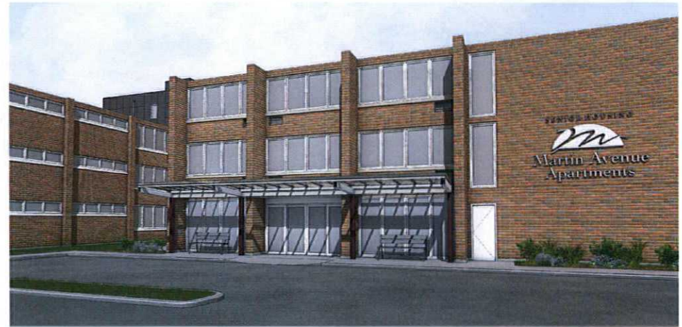
1 CANOPY VIEW 1