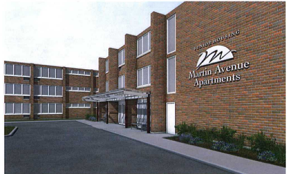
2 CANOPY VIEW 2