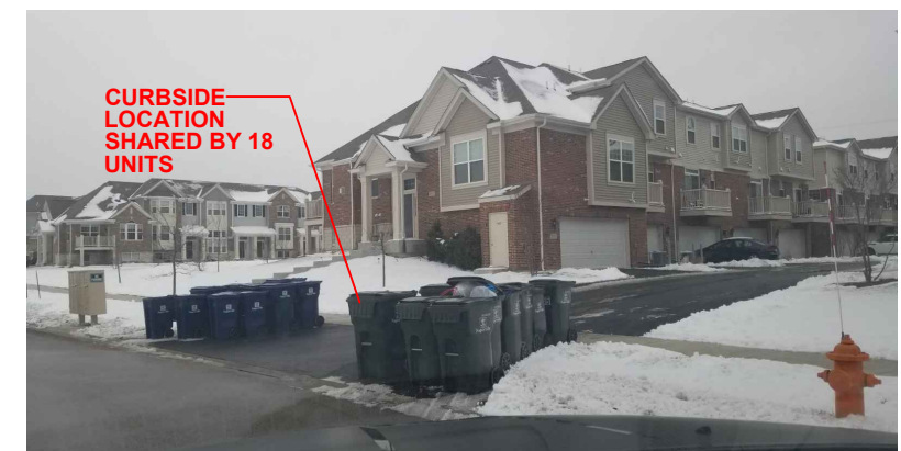
GARBAGE COLLECTION DAY EXAMPLE MAYFAIR SUBDIVISION, NAPERVILLE IL