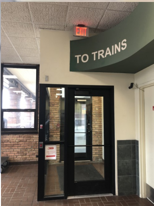
No ADA door openers or push buttons on west side building exit