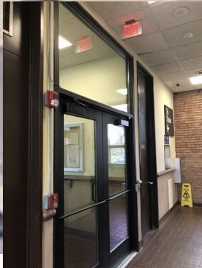
No ADA door openers or push buttons on east side building exit