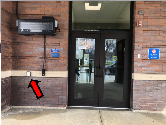
ADA push button approx. 6' from door on south side of building entrance: within regulations but not very practical