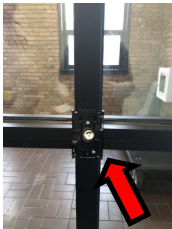
Mag Lock "Push To Exit Button" missing