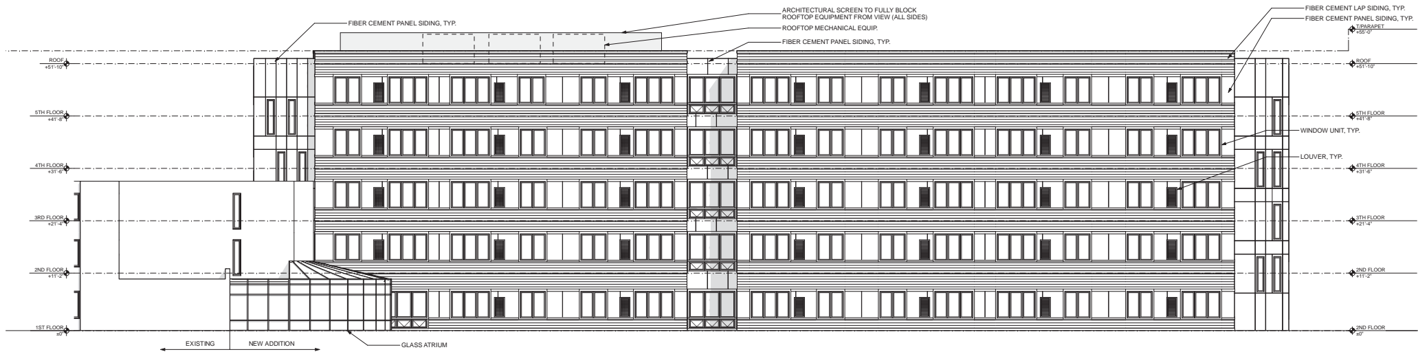
A NORTH ELEVATION