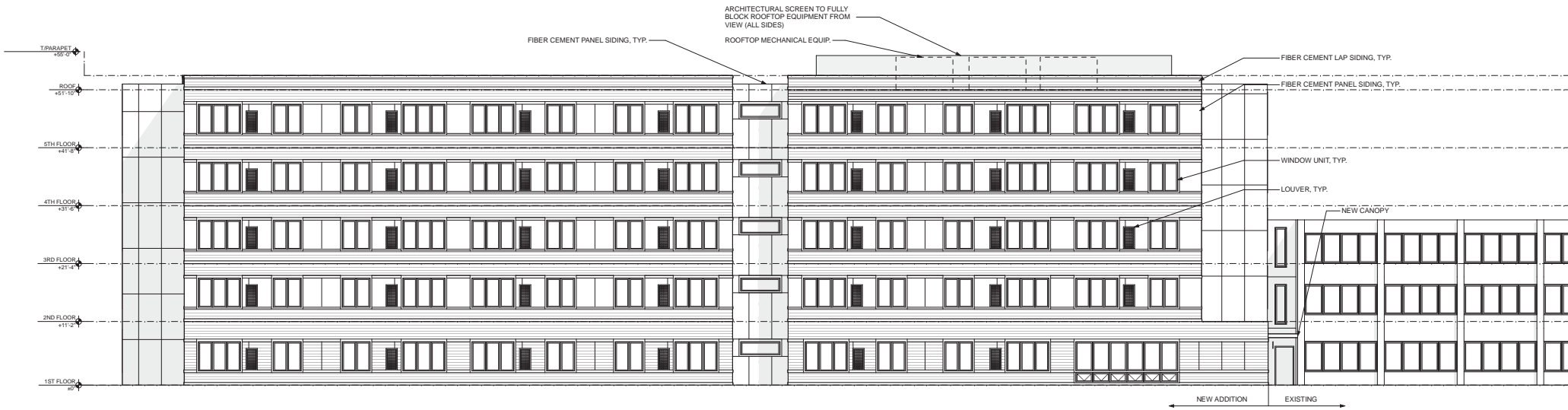
A SOUTH ELEVATION SCALE: 1/8" = 1'-0"