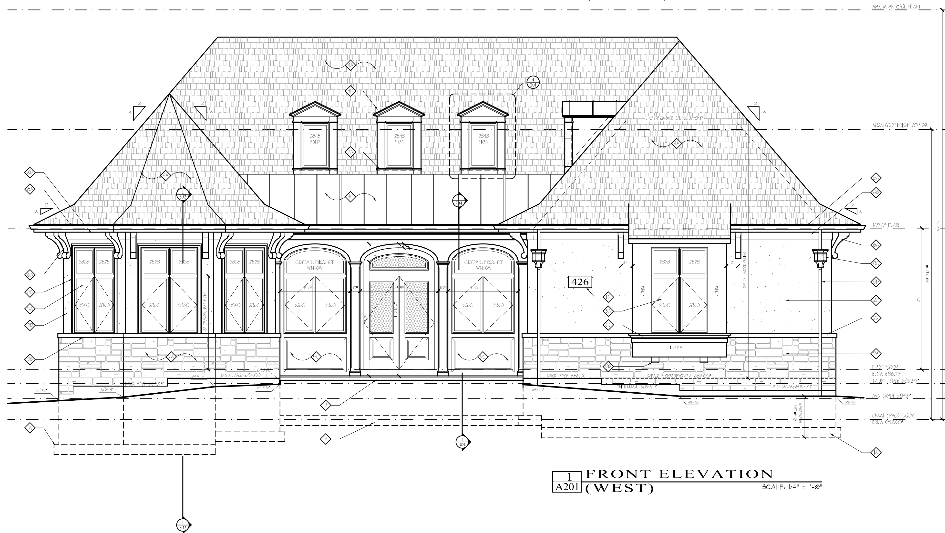
1 FRONT ELEVATION A201 (WEST) SCALE: 1/4" = 1'-0"

The Doriwala Residence 426 S Columbia Street Naperville IL 60540