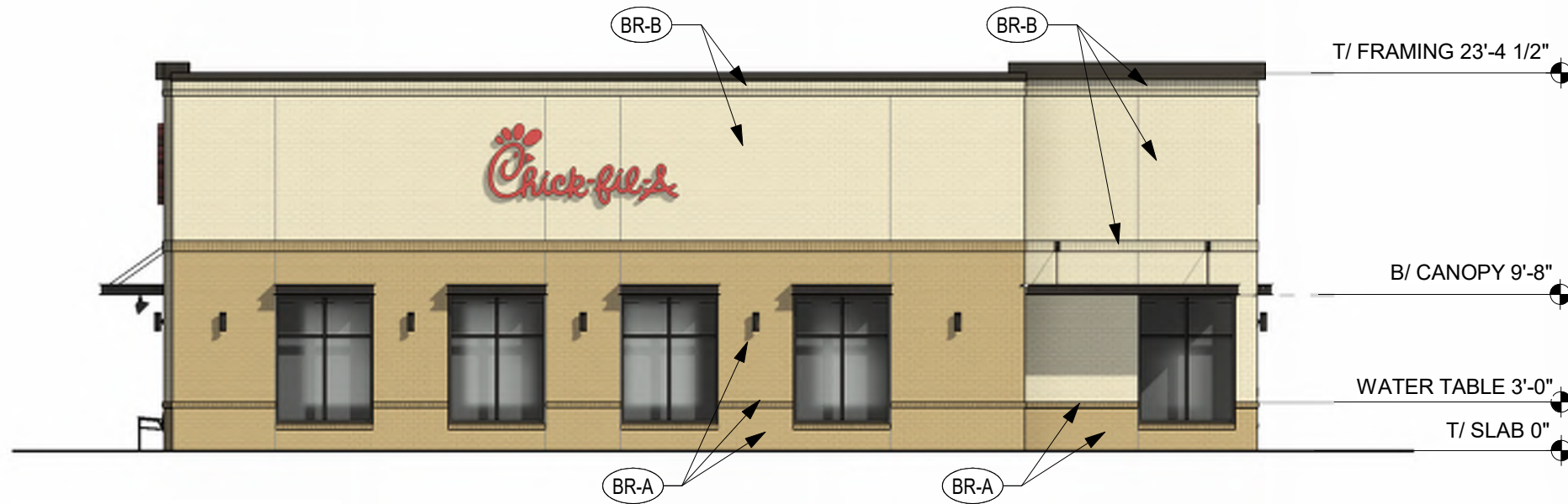
1 SOUTH ELEVATION N.T.S.