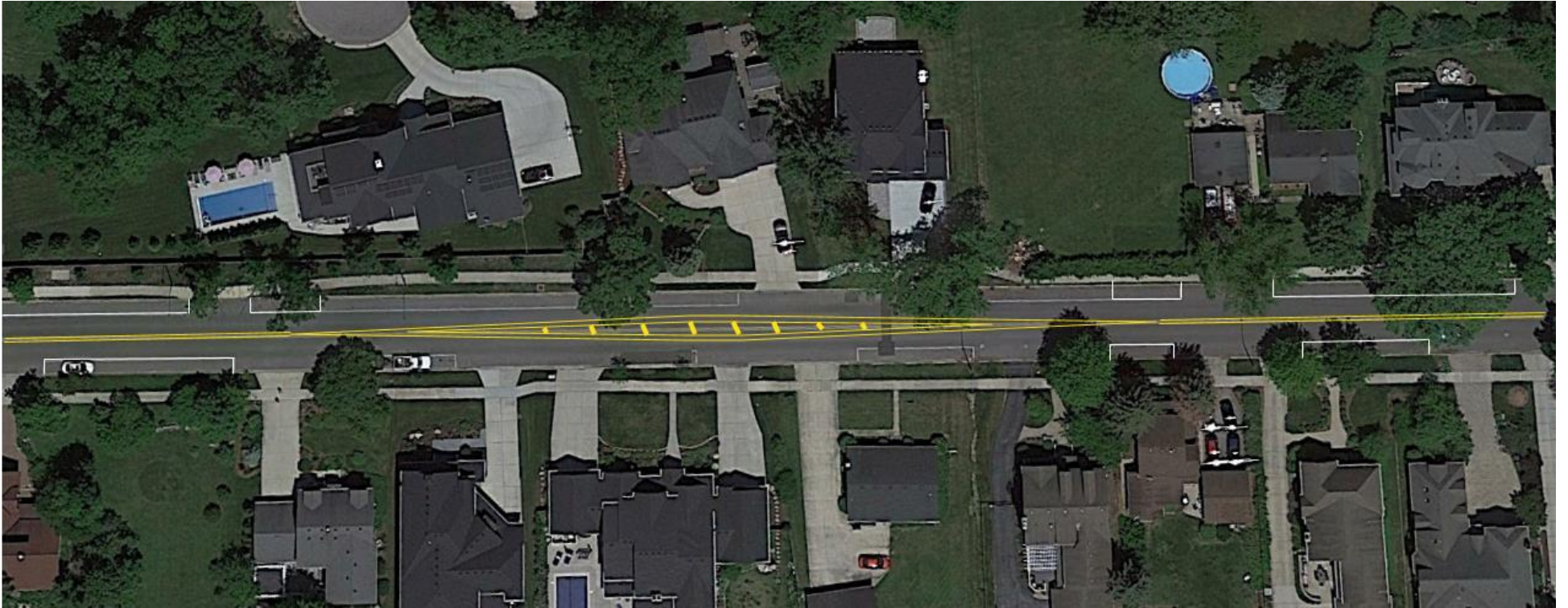
Detail of mid-block marked median between Parkway Drive and West Street