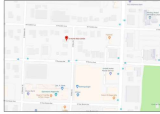
LOCATION MAP (NO SCALE)