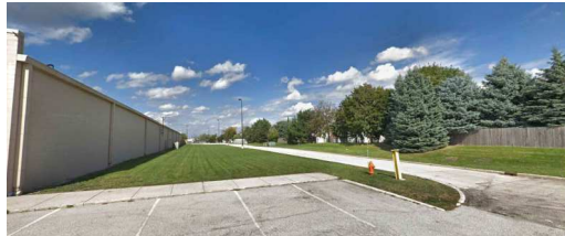
LOOKING TOWARDS NORTH ALONG THE EAST PROPERTY LINE