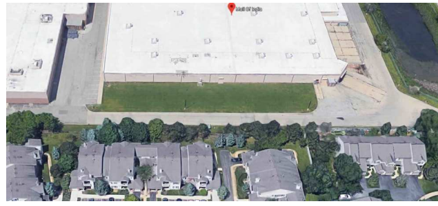
AERIAL VIEW: LOOKING WEST TOWARDS THE MALL FROM THE TOWN HOMES SIDE