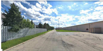
LOOKING TOWARDS SOUTH ALONG THE EAST PROPERTY LINE