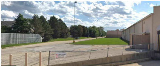
LOOKING TOWARDS SOUTH ALONG THE EAST PROPERTY LINE