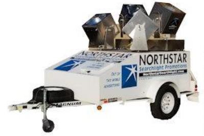
4-Beam Modular Trailer

Would you please issue a Temporary Use Permit for the pictured 4-Beam Searchlight for our Live Walk-Thru Nativity planned for Friday, December 10 from 5-9p and Saturday, December 11 from 6-10p at our Naperville Campus located at 1551 Hobson Road?