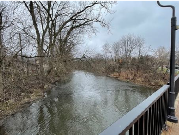
Hillside floodplain Residents affected