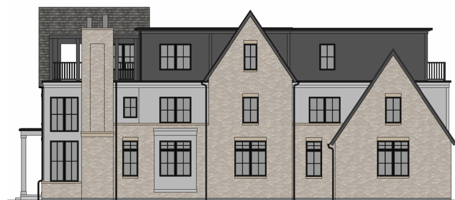
NORTH ELEVATION @ CORNER OF WEBSTER & VAN BUREN