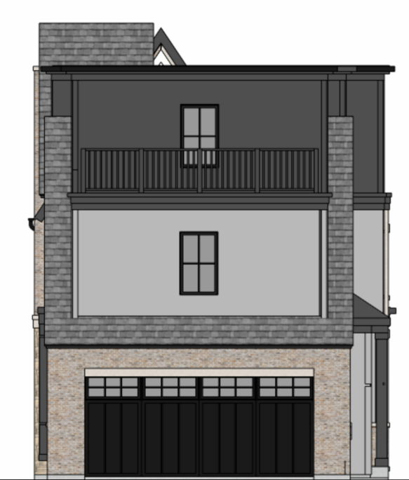
TYPICAL WEST ELEVATIONS