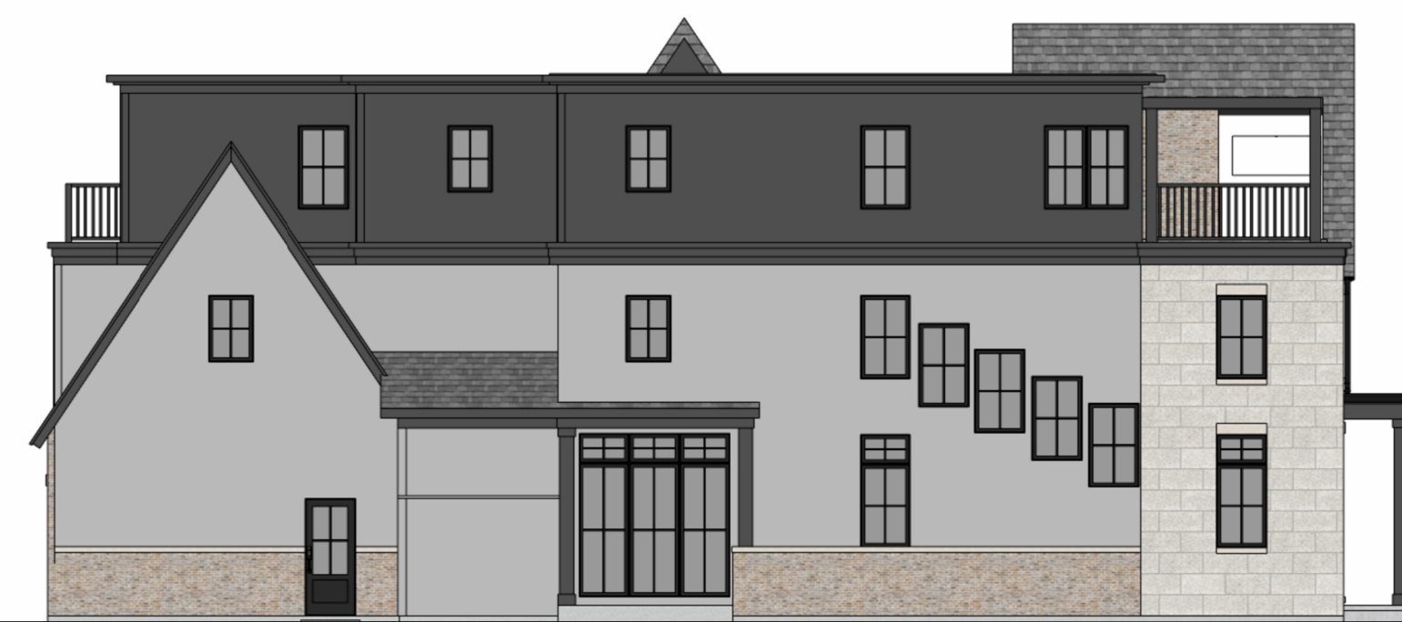
TYPICAL SOUTH ELEVATIONS