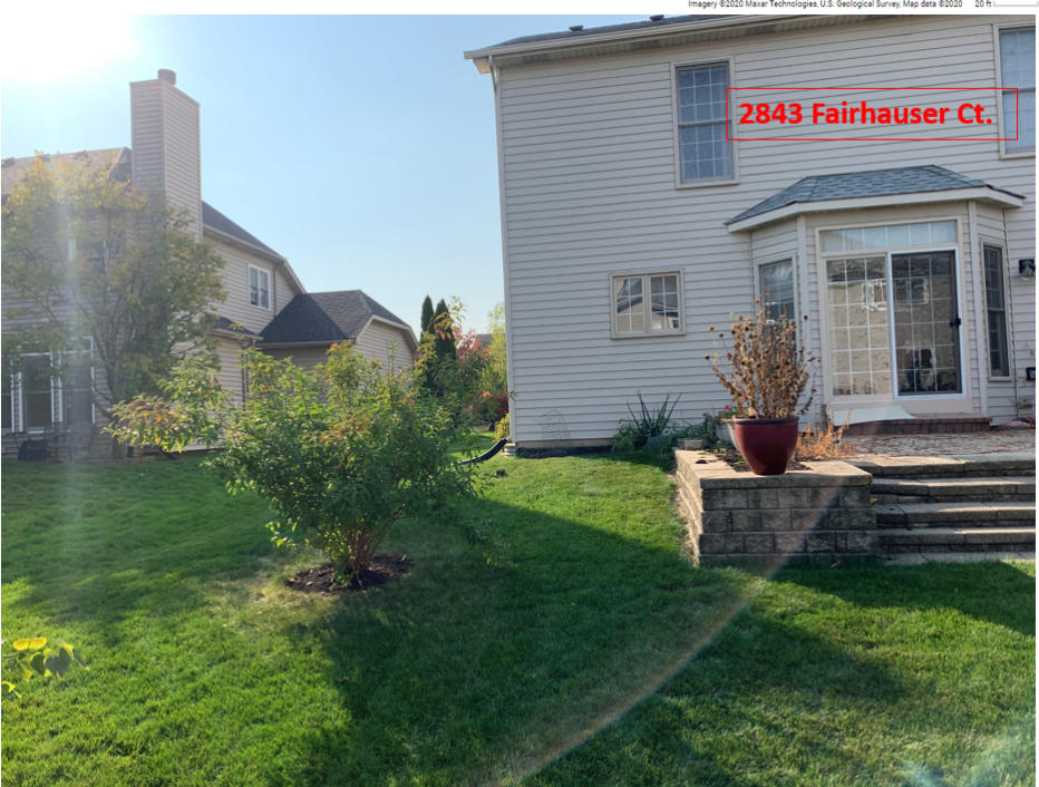
Picture taken from end of my property see how close is their structure, the sun room will bring the neighbors view close to my property.