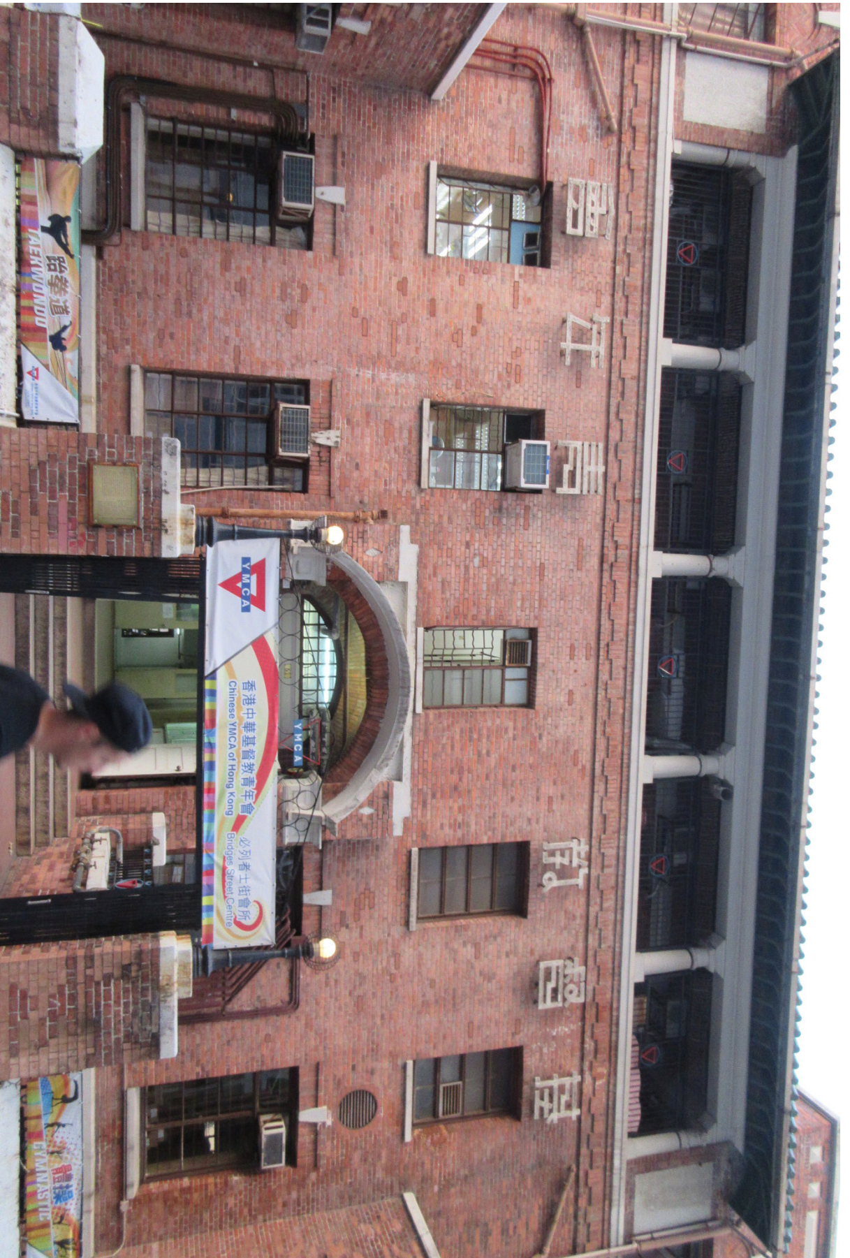
Exhibit 4: Shattuck & Hussey's Hong Kong YMCA as photographed in 2017