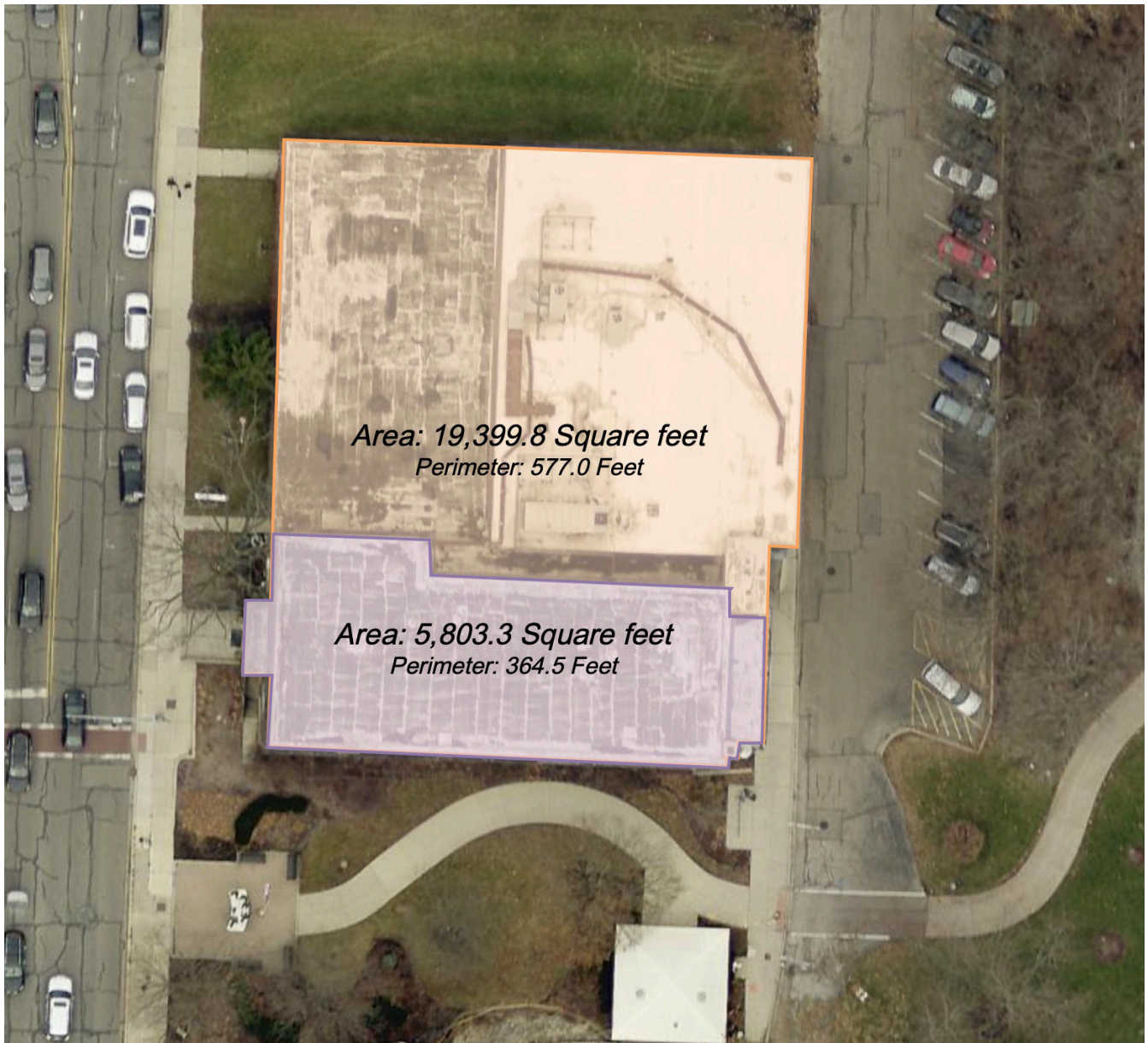
Exhibit 5: Estimates of the Kroehler Family YMCA footprints