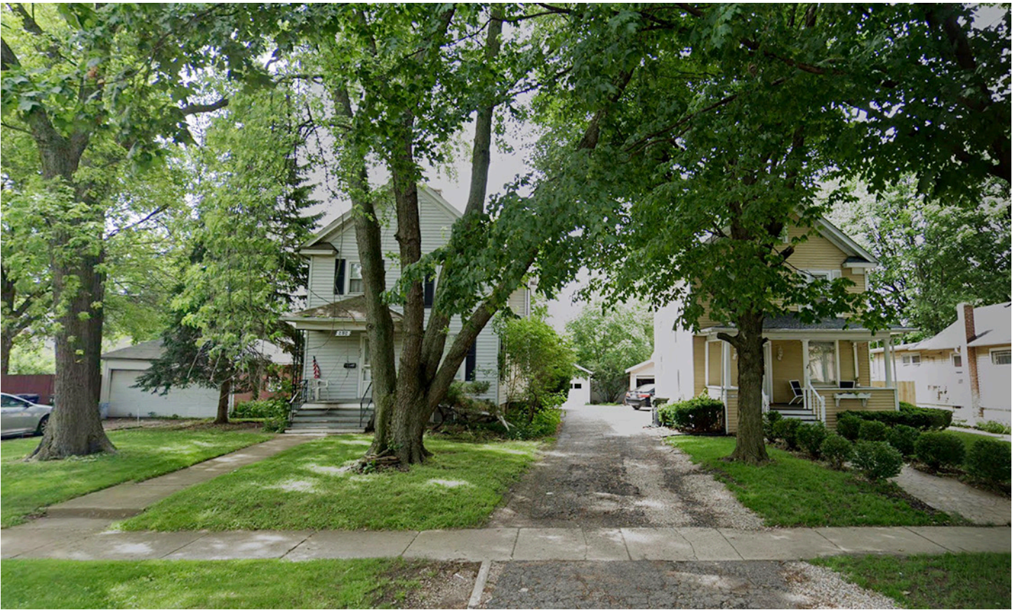
Figure 6: 252 and 248 E 4th Ave — Trees, height and mass of home to be demolished and its neighboring home.