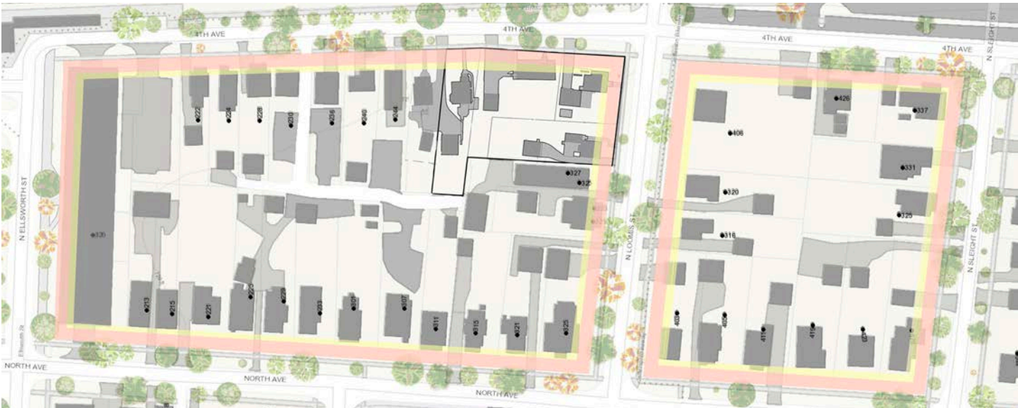
Figure 1: Density and 15' versus 25' Setbacks in the Surrounding Area with the Current Dwellings