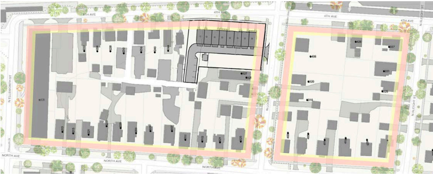
Figure 3: Density and 15' versus 25' Setbacks in the Surrounding Area with only 8-unit Townhomes