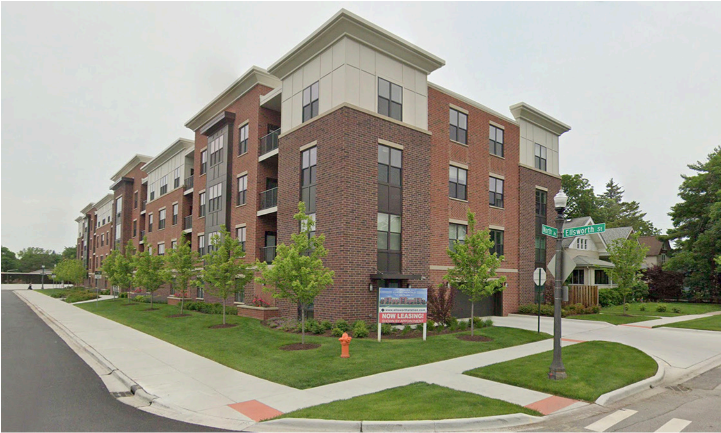
Figure 4: Ellsworth Station Apartments — Height and mass being proposed for the existing low density area.