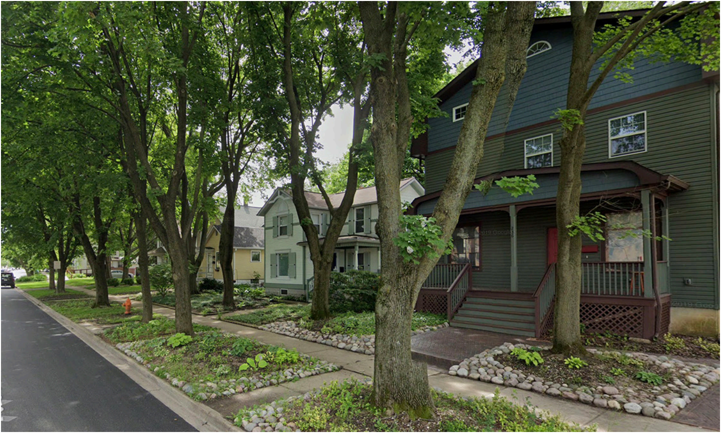
Figure 9: Southwest Corner of Loomis St. and 4th St.— Existing height and mass of proposed area.