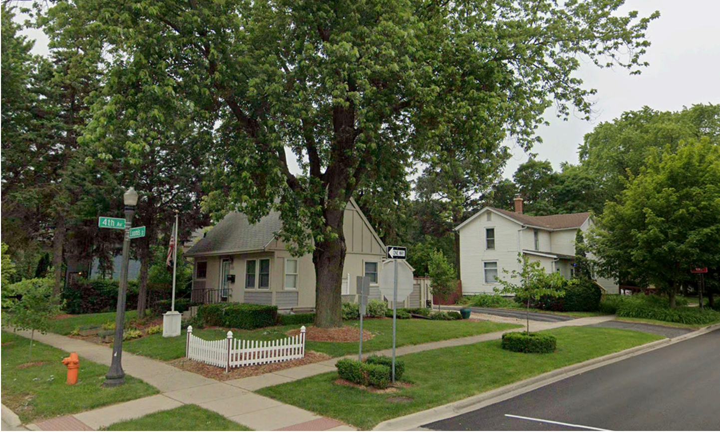
Figure 5: Southwest Corner of Loomis St. and 4th St.— Existing height and mass of proposed development area.