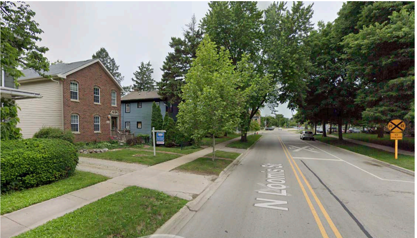
Figure 7: 325 N Loomis St.— Existing residence to the south of the development and its setback.