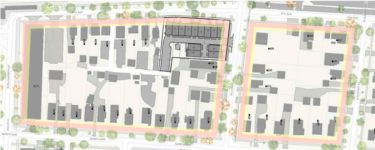
Figure 2: Density and 15' versus 25' Setbacks in the Surrounding Area with the Proposed 15-unit Townhomes