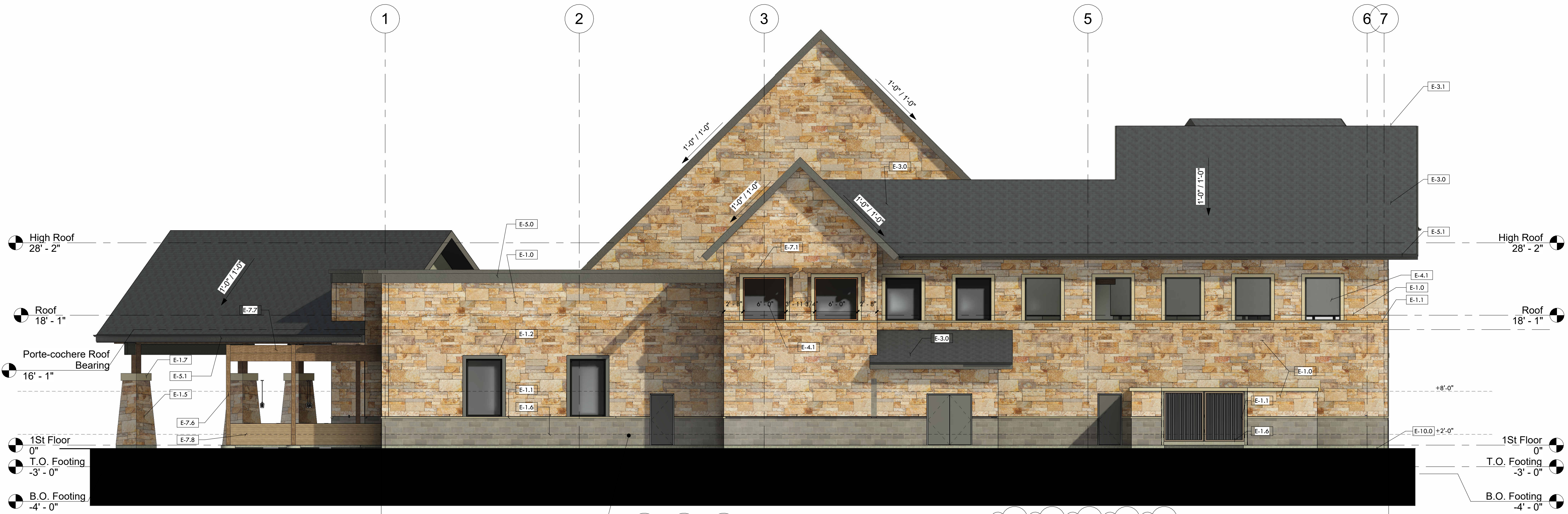
3 South Elevation A-1.1 1/8" = 1'-0"

3,052 SF Chilton Royal Chateau Stone 459 SF Blue Stone 362 SF Glass 188 SF Cut Stone (Limestone) 99 SF Alum Coping/ Fascia 171.4 SF Asphalt Roofing 139 SF Douglas Fir