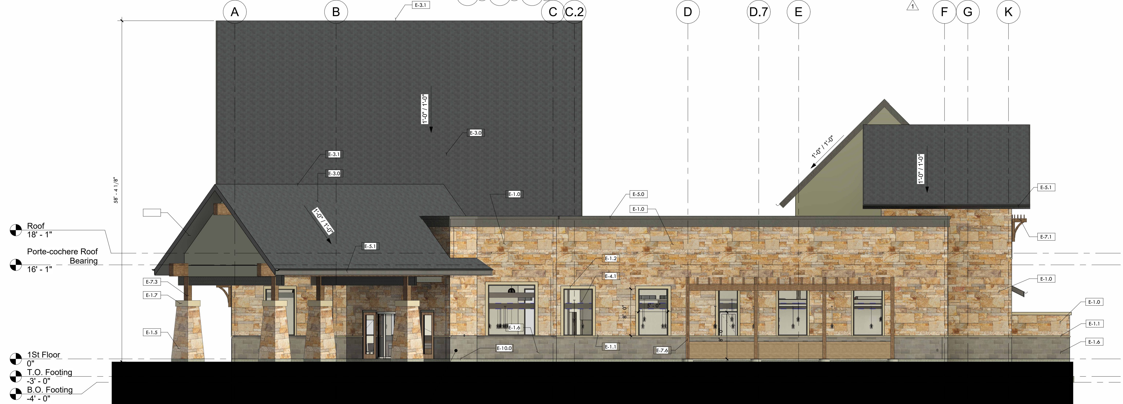
2 West Elevation A-1.1 1/8" = 1'-0"

Glass on this Facade (Between 2'-0" and 8'-0") 840.6875 SF Total Area 30 SF Glass 3.57% Glass (294.2406 SF to achieve 35%) 49'-0 1/2" x 6'-0"