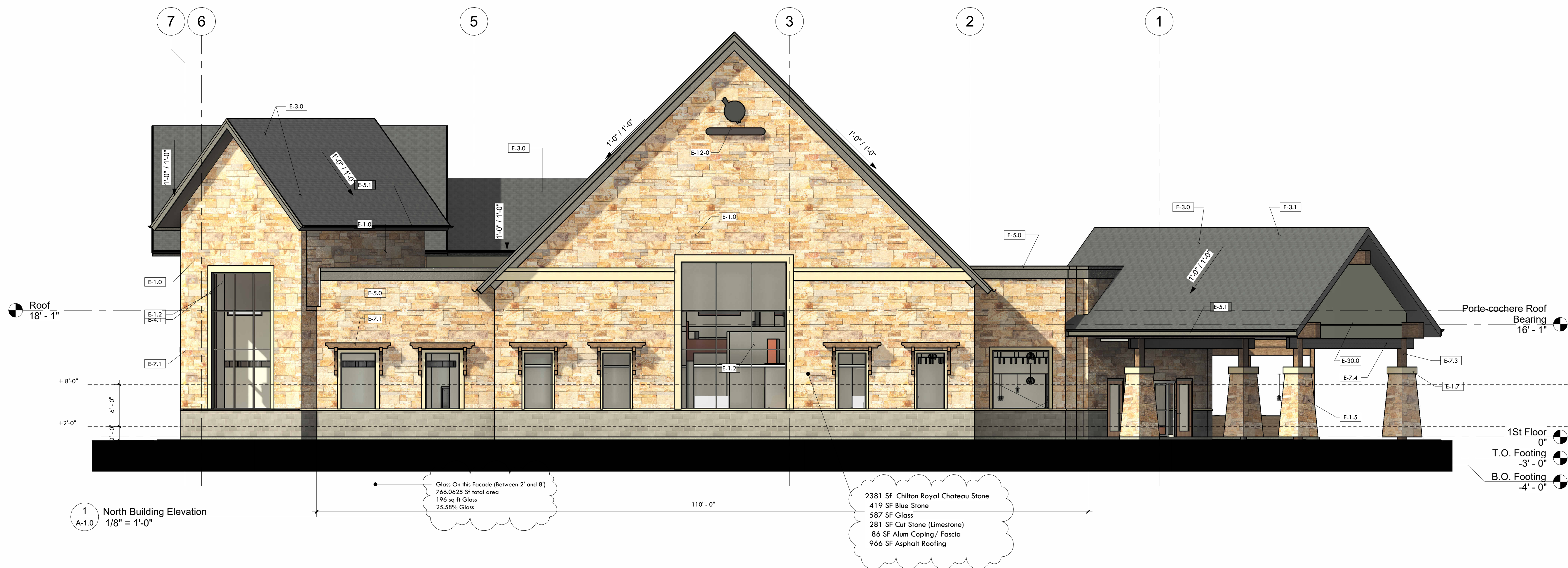
1 North Building Elevation A-1.0 1/8" = 1'-0"