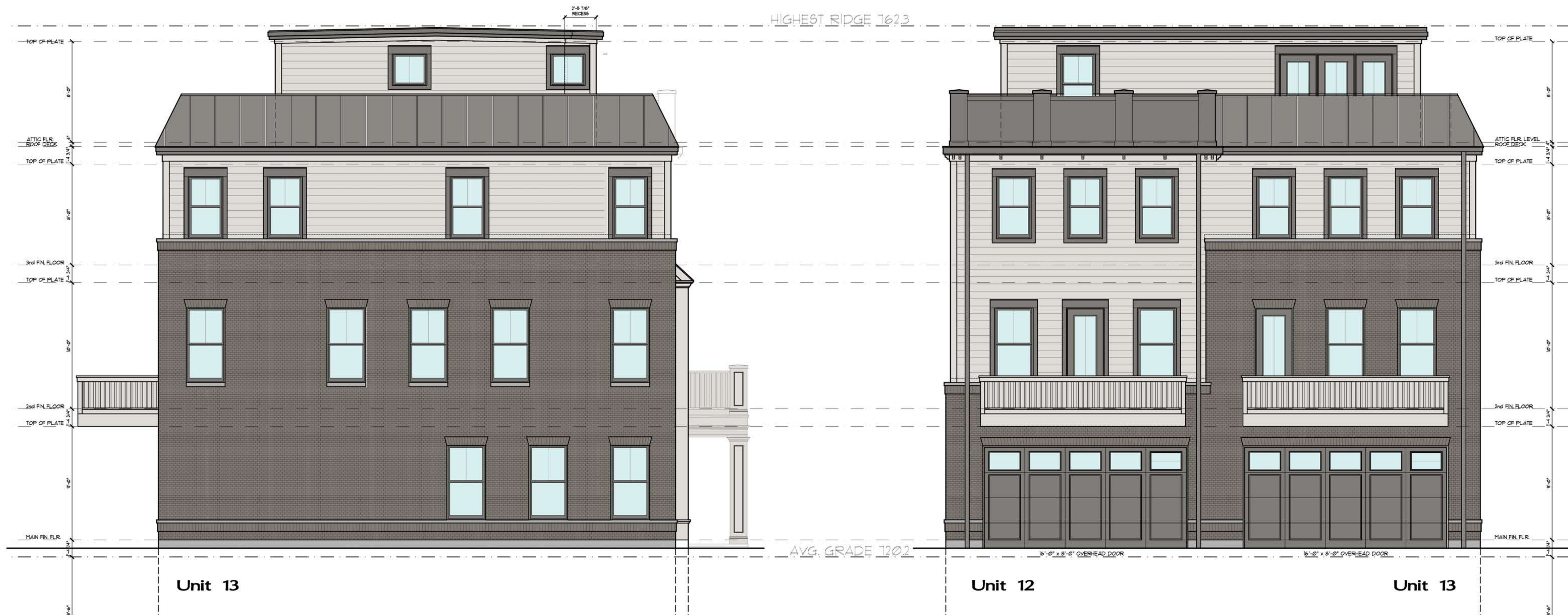
2 P205 Duplex 2 – Drive Elevation (North) SCALE: 1/4" = 1'-0"