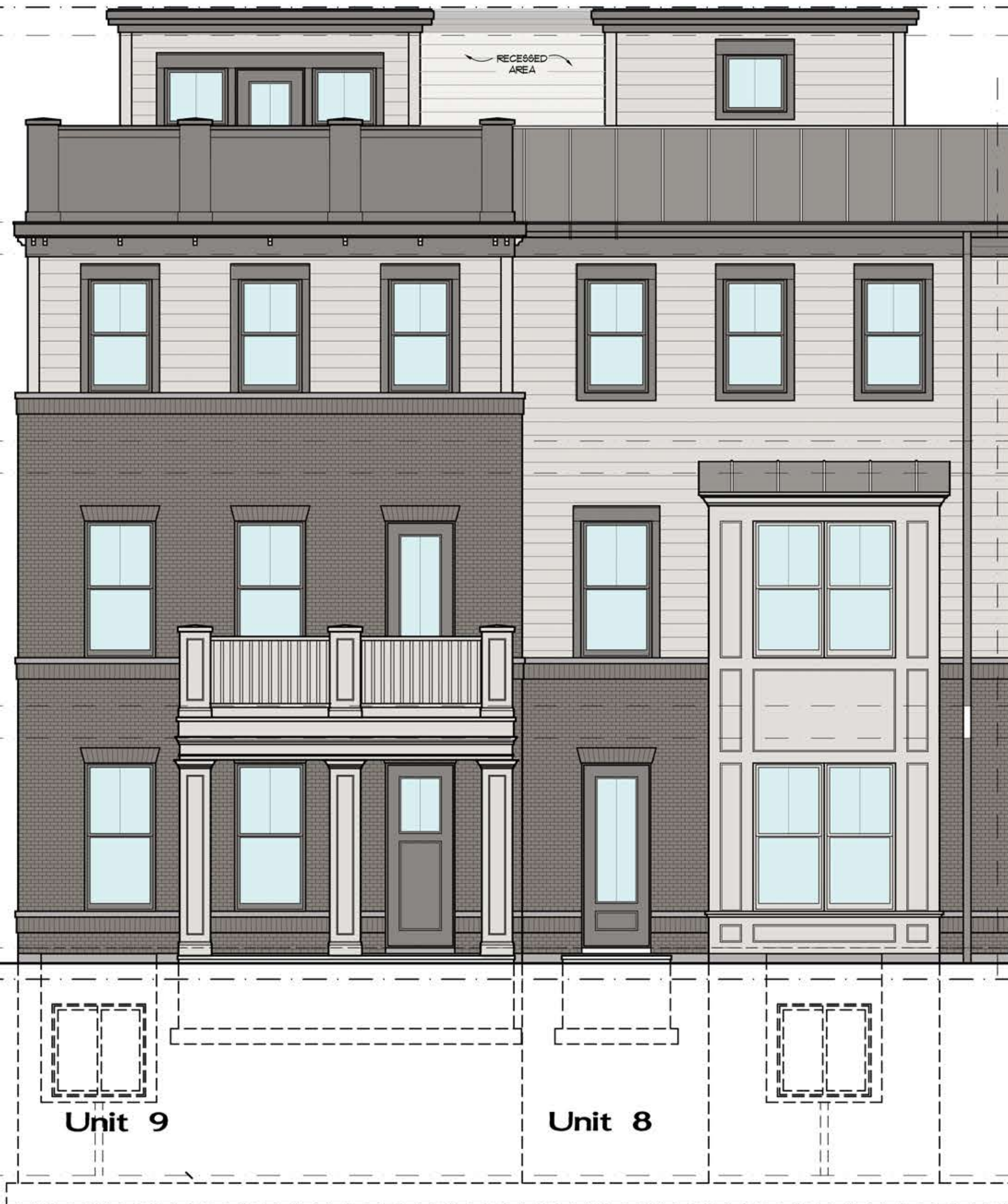
3 P206 9 Unit Building – 4th Avenue Elevation (North– West end of Bldg) SCALE: 1/4" = 1'-0"