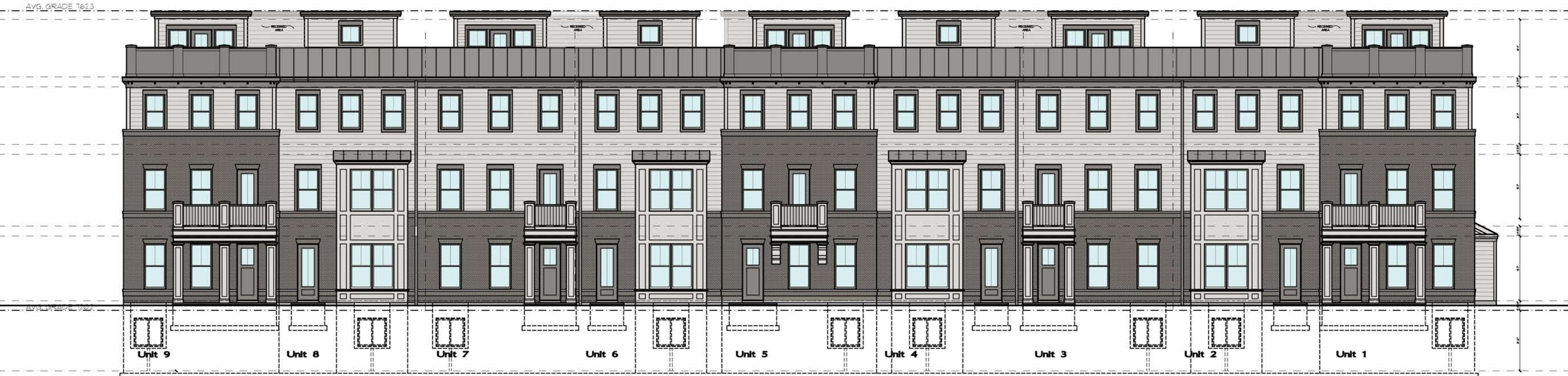
1 P206 9 Unit Building – 4th Avenue Elevation (North–Front) SCALE: 1/8" = 1'-0"