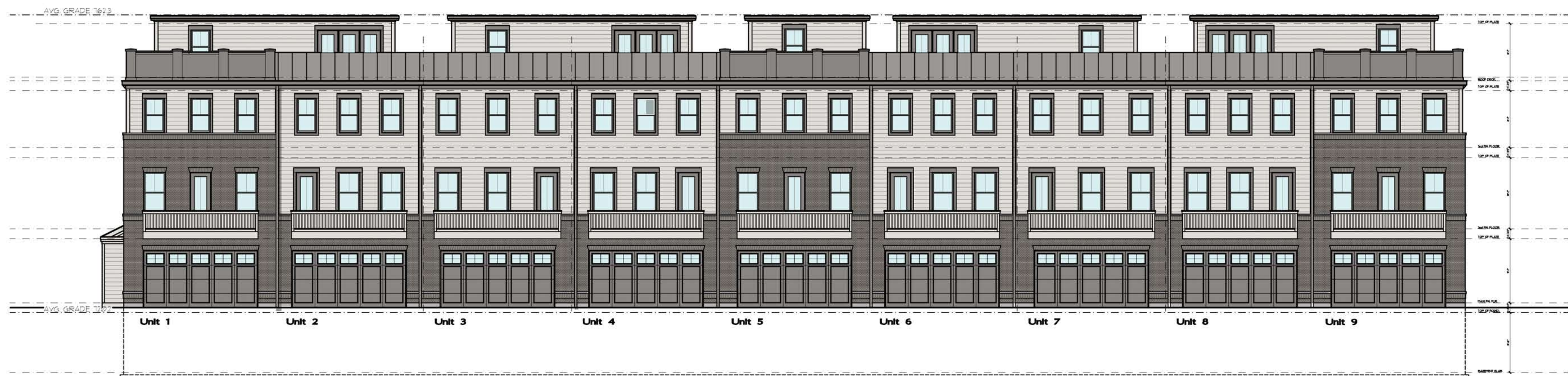
1 P207 9 Unit Building – Driveway Elevation (South) SCALE: 1/8" = 1'-0"