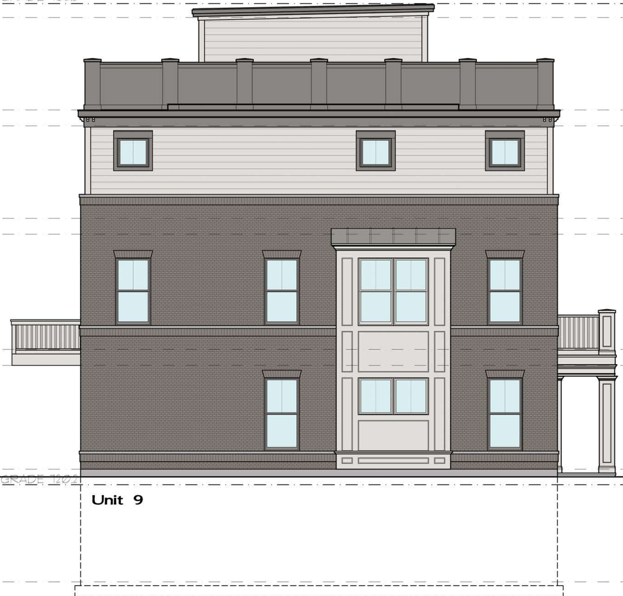
2 P206 9 Unit Building – Loomis St. Elevation (East) SCALE: 1/4" = 1'-0"