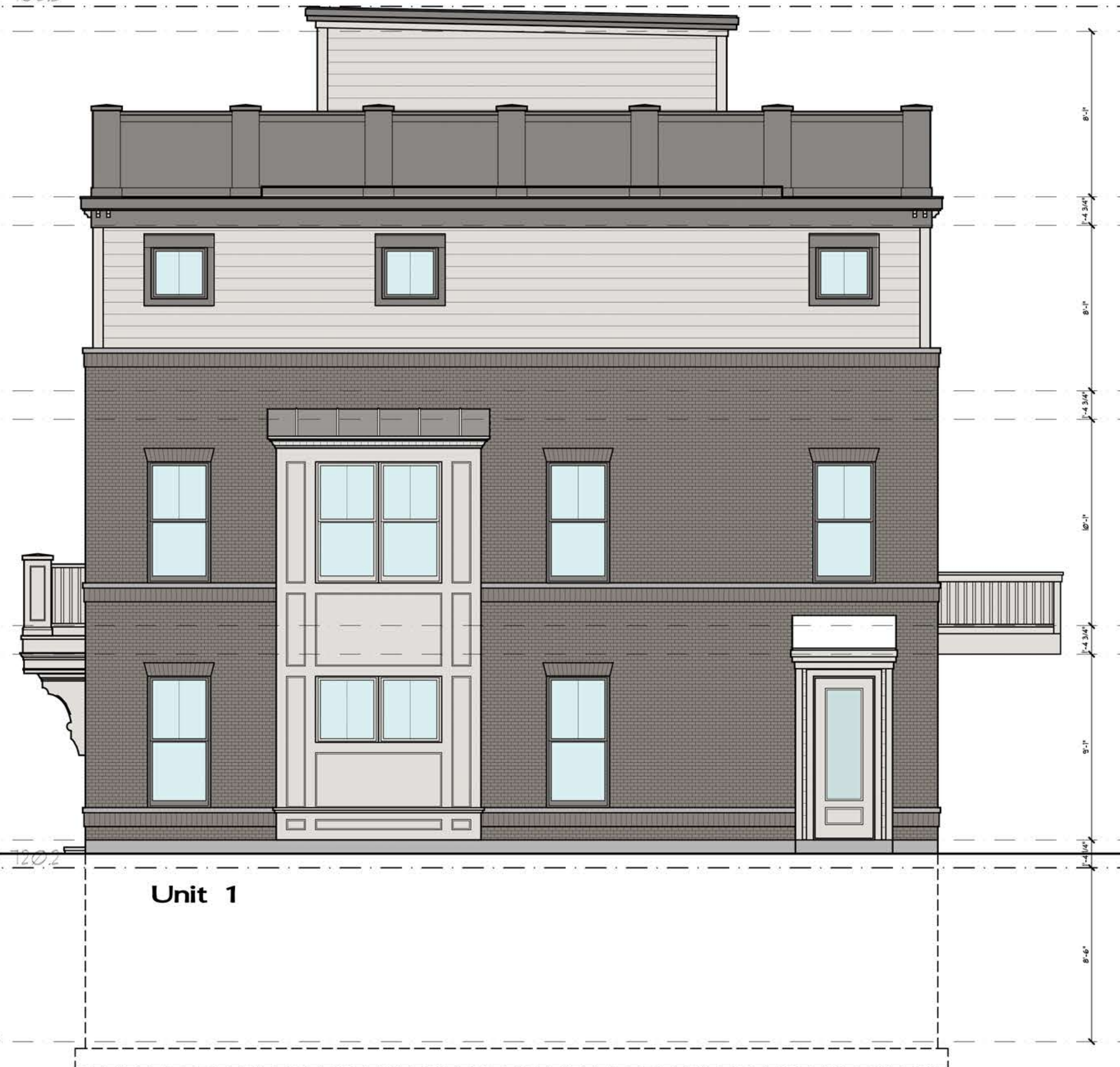
2 P207 9 Unit Building – Side Elevation (West) SCALE: 1/4" = 1'-0"