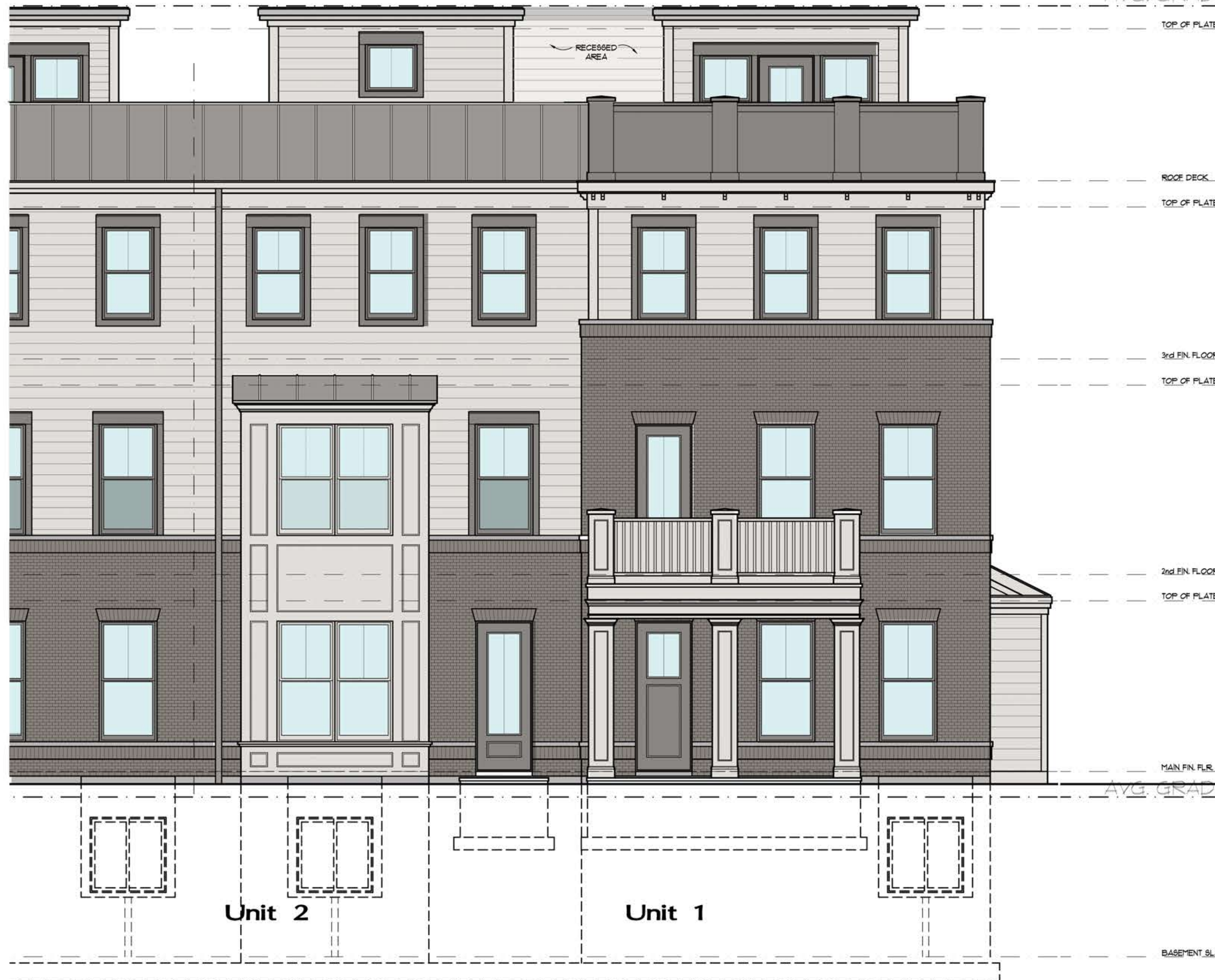
3 P207 9 Unit Building – 4th Avenue Elevation (North– East end of Bldg) SCALE: 1/4" = 1'-0"