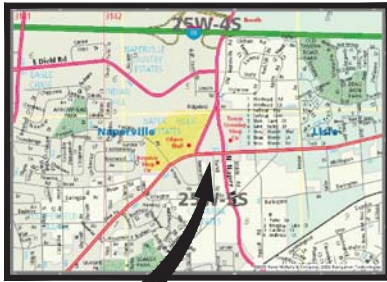
SITE LOCATION MAP NOT TO SCALE