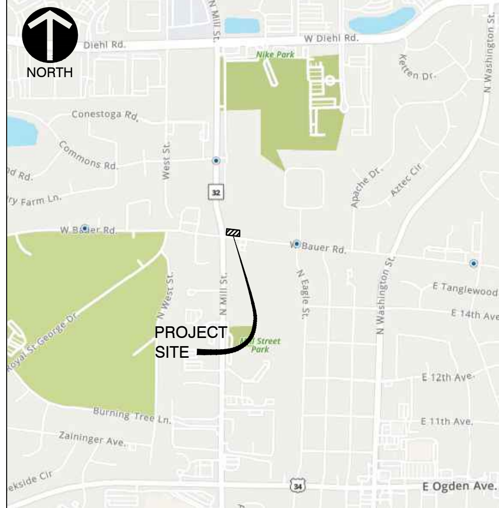
LOCATION MAP N.T.S.

THIS PLAT HAS BEEN SUBMITTED FOR RECORDING BY AND RETURN TO: NAME: NAPERVILLE CITY CLERK ADDRESS: 400 S. EAGLE STREET NAPERVILLE, ILLINOIS 60540