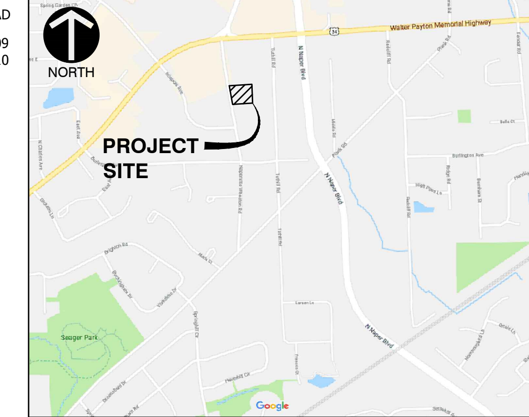
LOCATION MAP N.T.S.

THIS PLAT HAS BEEN SUBMITTED FOR RECORDING BY AND RETURN TO: NAME: NAPERVILLE CITY CLERK ADDRESS: 400 S. EAGLE STREET NAPERVILLE, ILLINOIS 60540