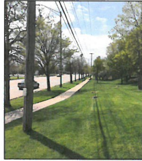
Existing View Looking West Along North Aurora Road