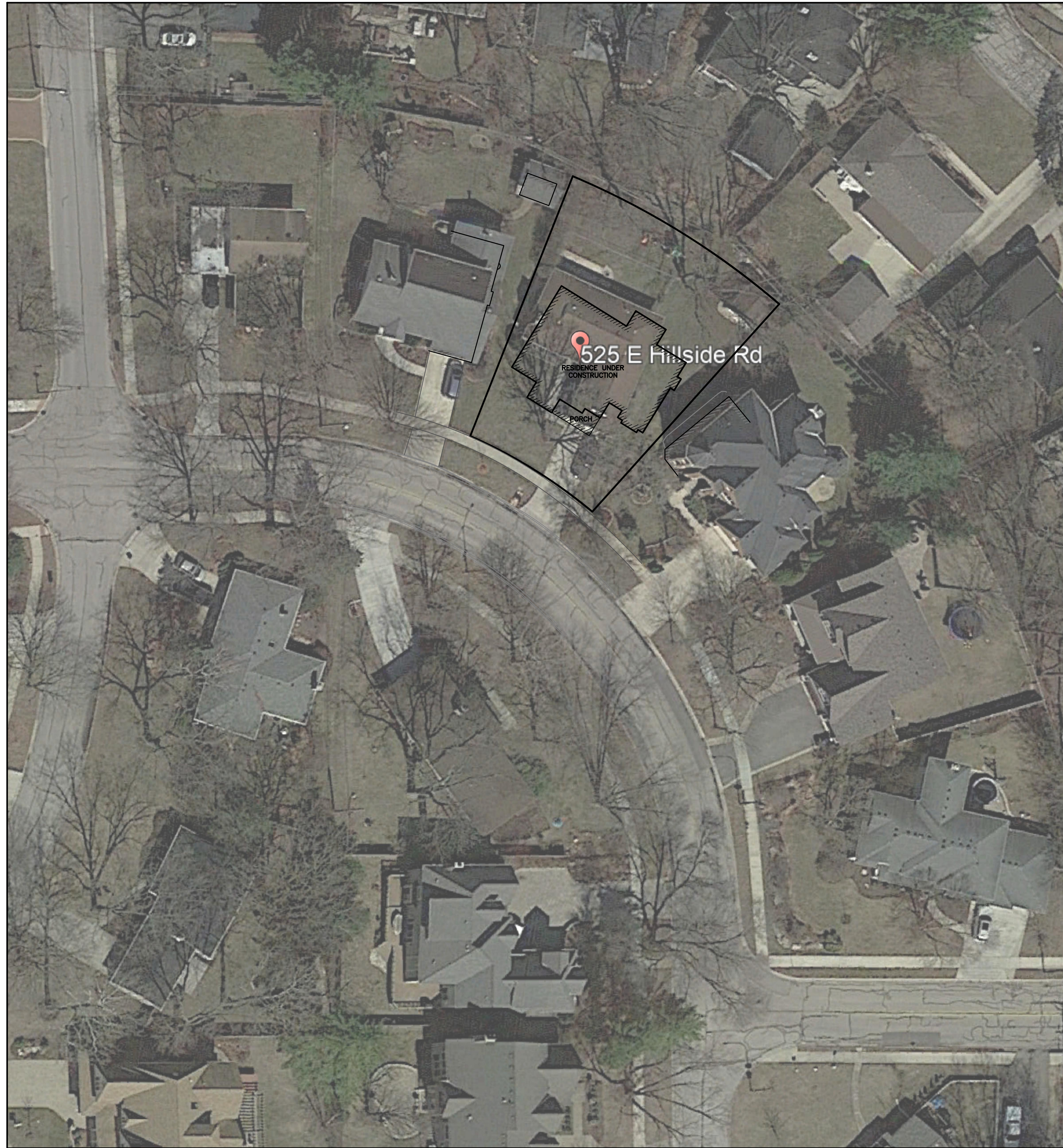
AERIAL EXHIBIT - 30 SCALE

DATE: DECEMBER 13, 2022 DRAWN BY: MAJ DATE SCALE: AS NOTED CHECKED BY: JGC PROJECT NO: 323-897 APPROVED BY: JGC