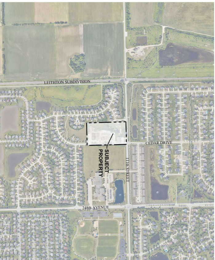
LOCATION MAP SCALE: 1"=400' NORTH

CIVIL ENGINEER: CEMCON, Ltd. CONSULTING ENGINEER, LAND SURVEYORS & PLANNERS 2280 WHITE OAK CIRCLE, SUITE 100 AURORA, IL 60502-9675