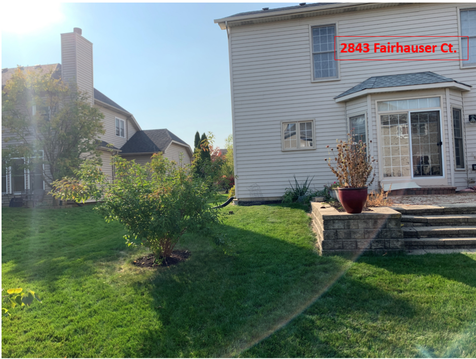
Picture taken from end of my property [REDACTED] see how close is their structure, the sun room will bring the neighbors view close to my property.