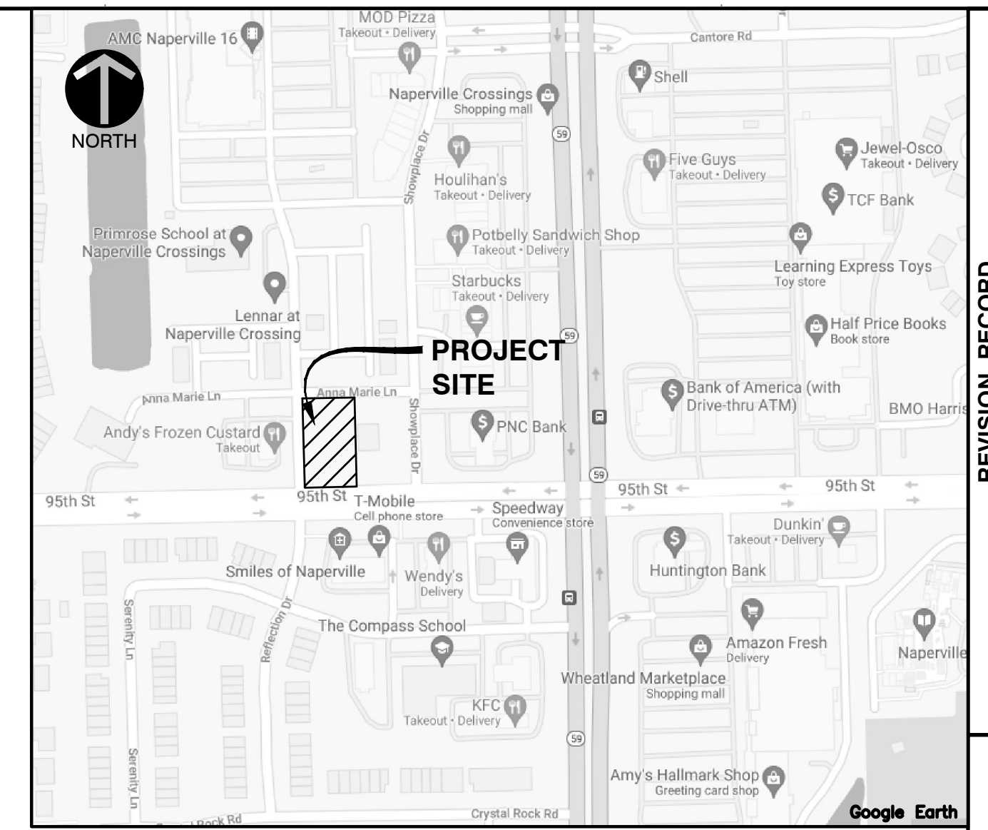
SITE MAP N.T.S.

THIS PLAT HAS BEEN SUBMITTED FOR RECORDING BY AND RETURN TO: NAME: NAPERVILLE CITY CLERK ADDRESS: 400 S. EAGLE STREET NAPERVILLE, ILLINOIS 60540