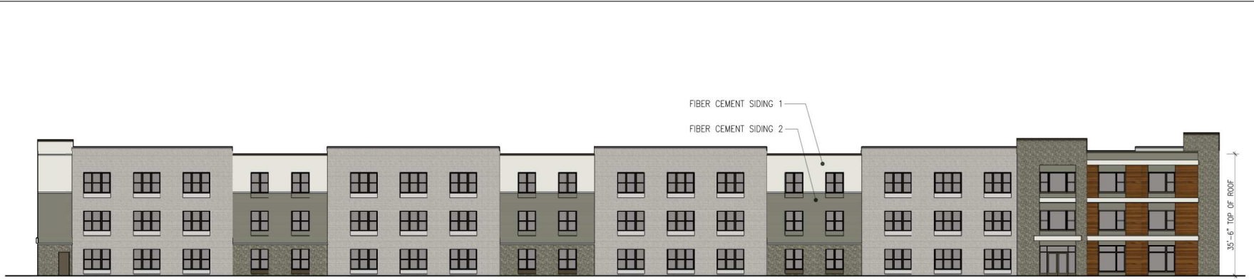
EAST ELEVATION (TUTHILL ROAD)