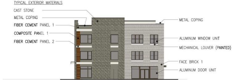
NORTH ELEVATION (OGDEN AVE)