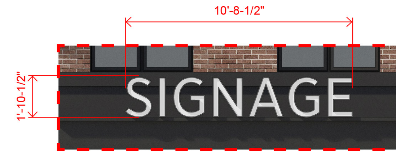
RESIDENTIAL BUILDING FRONT ENTRY SIGN PLACEHOLDER