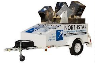
4-Beam Modular Trailer

Would you please issue a Temporary Use Permit for the following 4-Beam Searchlight for our Live Drive-Thru Nativity planned for Friday, December 18 from 5-8p and Saturday, December 19 from 6-9p at our Naperville Campus located at 1551 Hobson Road?