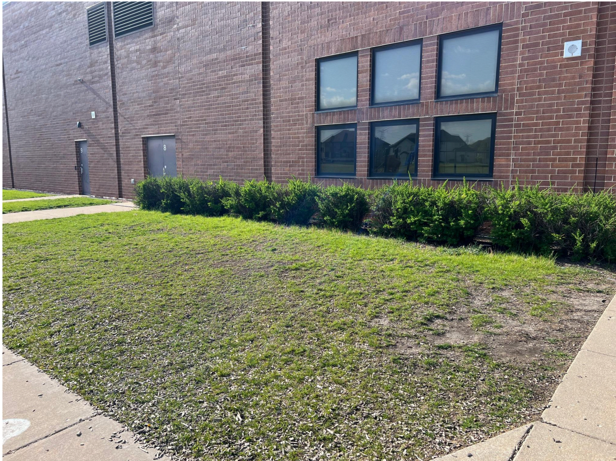
Site 2A: Peterson Elementary Adjacent to recess area