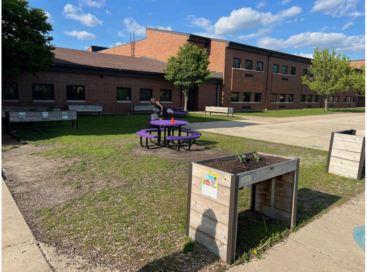
Existing community initiative for educational planters.