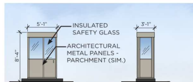
④ WARMING HUT ELEVATIONS SCALE: 1" = 40'