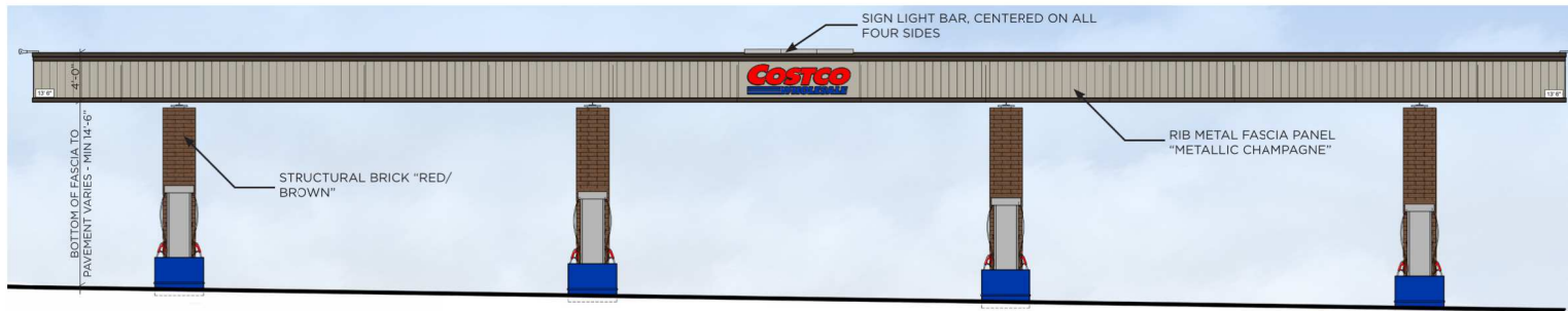
① CANOPY AND DISPENSER ELEVATION (EAST/WEST) SCALE: 1" = 40'