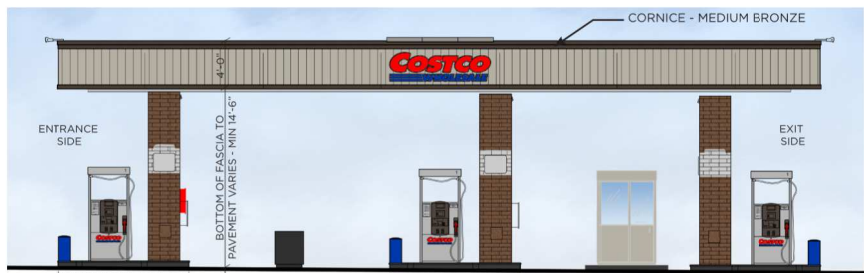
② CANOPY AND DISPENSER ELEVATION (NORTH/SOUTH) SCALE: 1" = 40'