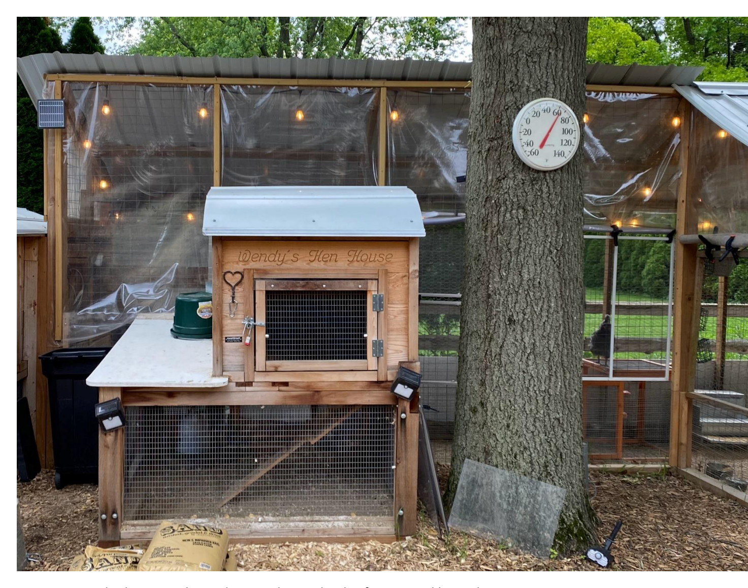
Coop 2 is attached to Run 1 but only open during the day for optional laying boxes.

Like Coop 1, Coop 2 constructed of Solid Cedar has heavy duty 16-gauge galvanized predator-proof welded wire on all exterior openings.