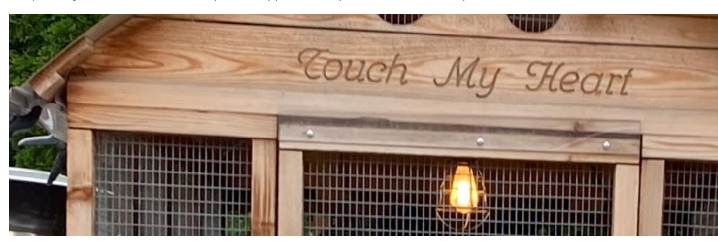
Coop 1 height is 90" with base footprint of approximately 12' wide and 7' deep

Close up of heavy duty 16-gauge galvanized screening used in the coops.