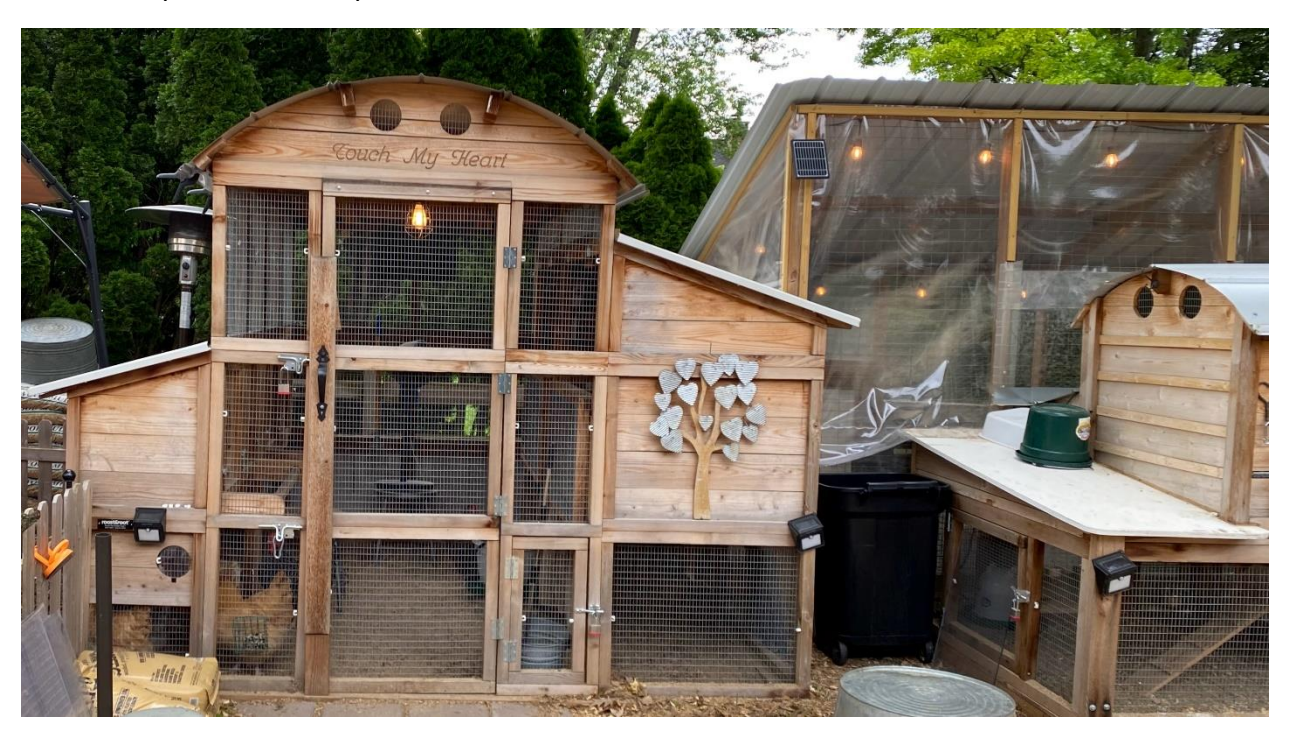
Coop 1 is connected to Run 1.

Coop 1 sits on 4" x 4" boards and is constructed of Solid Cedar with heavy duty 16-gauge galvanized predator-proof welded wire on all exterior openings.