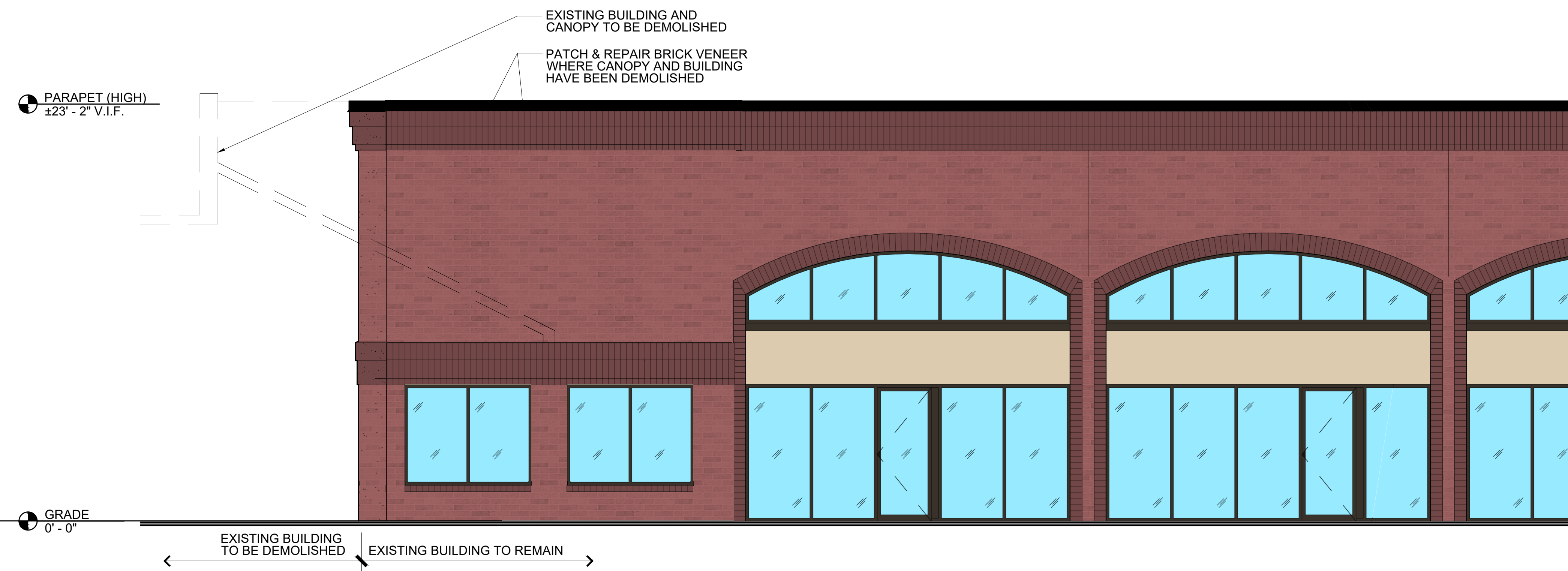
1 PARTIAL EAST ELEVATION 1/4" = 1'-0"