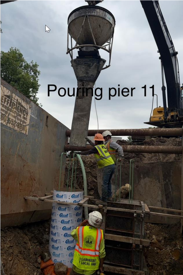
Pouring pier 11