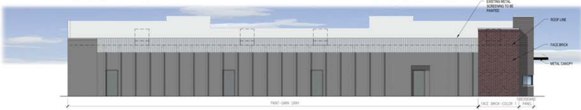
4 NORTH ELEVATION SCALE: 1/8"=1'-0"