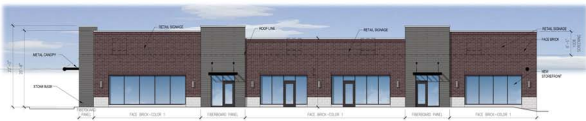
1 SOUTH ELEVATION SCALE: 1/8"=1'-0"