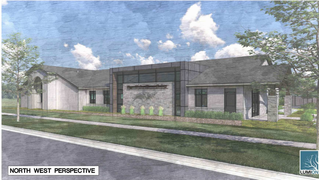
NORTH WEST PERSPECTIVE

2/18/2019 10:58 AM by [unreadable] 02/18/2019 10:58 AM 1:43