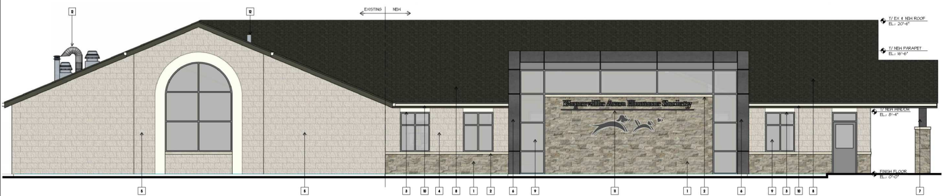
NORTH ELEVATION SCALE 1/4" = 1'-0"