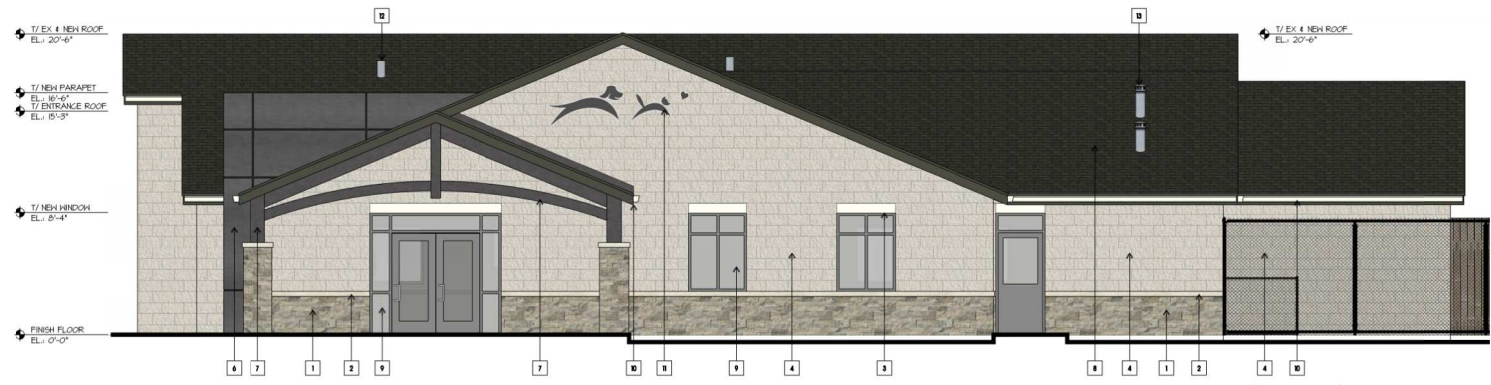
WEST ELEVATION SCALE 1/4" = 1'-0"