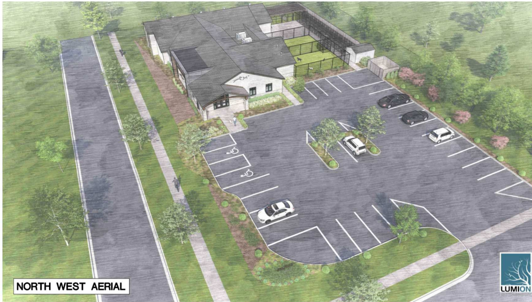
NORTH WEST AERIAL