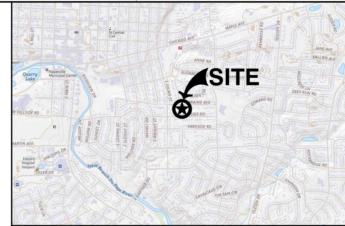
LOCATION MAP N.T.S. MAP PROVIDED BY USGS DATED 2021

THIS PLAT HAS BEEN SUBMITTED FOR AND RETURN TO: NAME: NAPERVILLE CITY CLERK 400 SOUTH EAGLE STREET NAPERVILLE, IL 60540