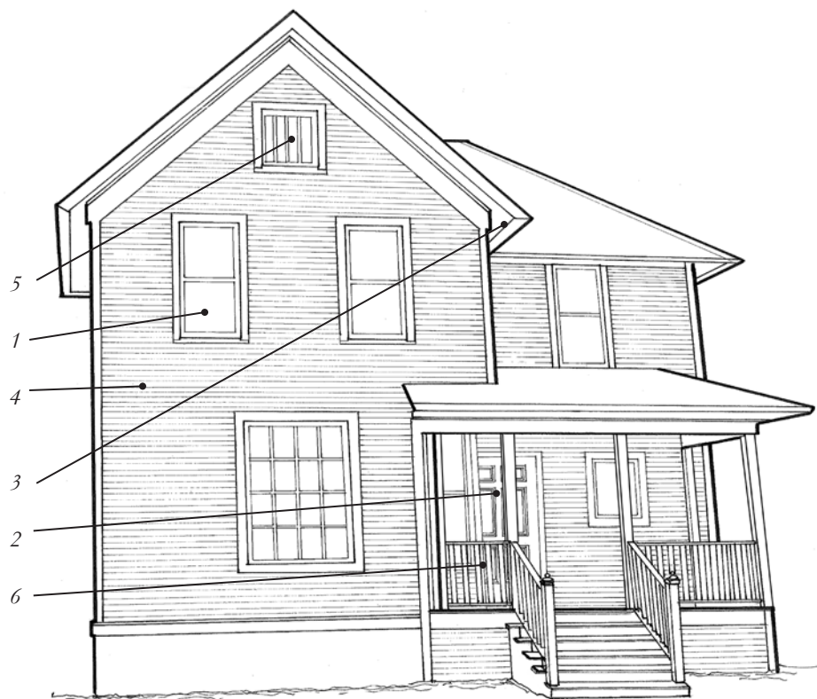
Illustration C.8 - Example of a Vernacular style residence