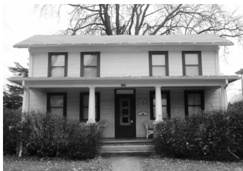
Photo C.15 - I-Form vernacular style residence - 154 Center Street