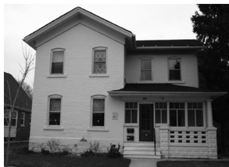
Photo C.16 - L-Form vernacular style residence - 214 N. Ellsworth Street