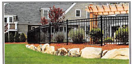
Ameristar Montage Steel Fence