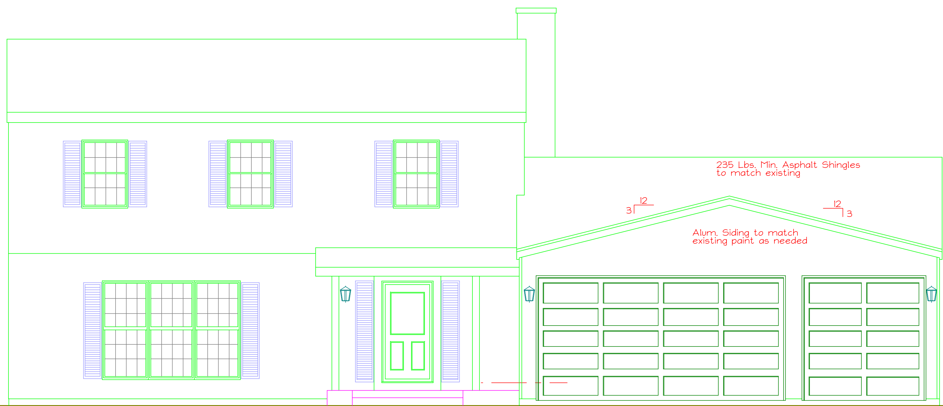
EAST ELEVATION SCALE: 1/4" = 1' - 0"